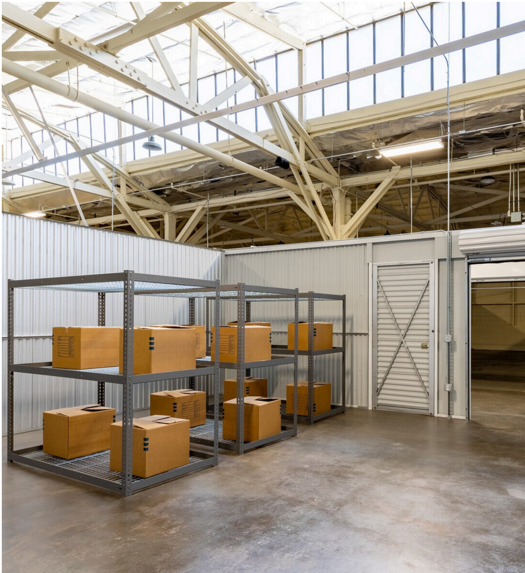
PACKAGE & PALLET RECEIVING SERVICES + PALLET JACKS & CARTS