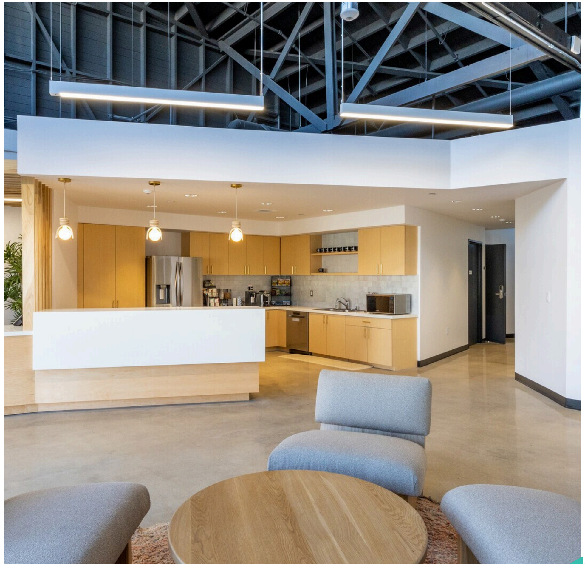
KITCHEN & COFFEE BAR