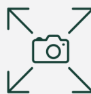
Photo & Podcast Studio