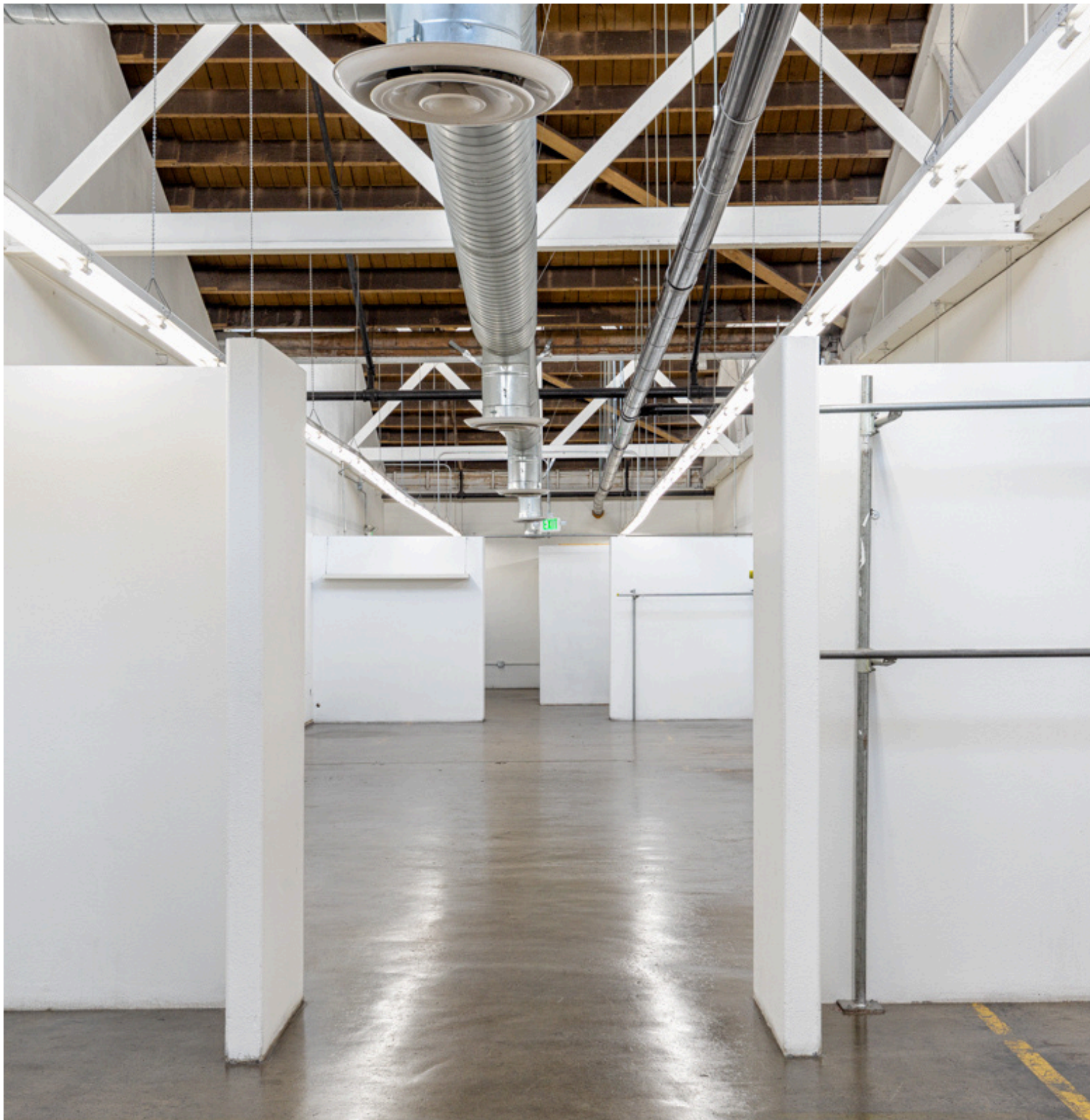
WAREHOUSE SPACES FROM 300-2,000+ SF