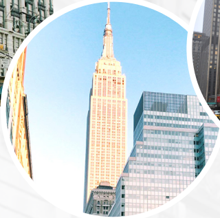
Empire State Building