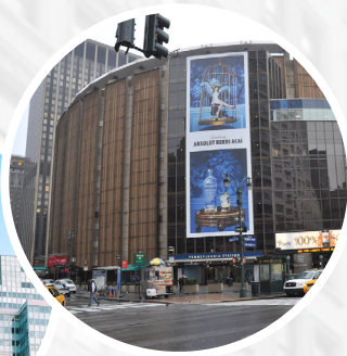
Madison Square Garden