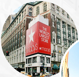
Macy's Department Store