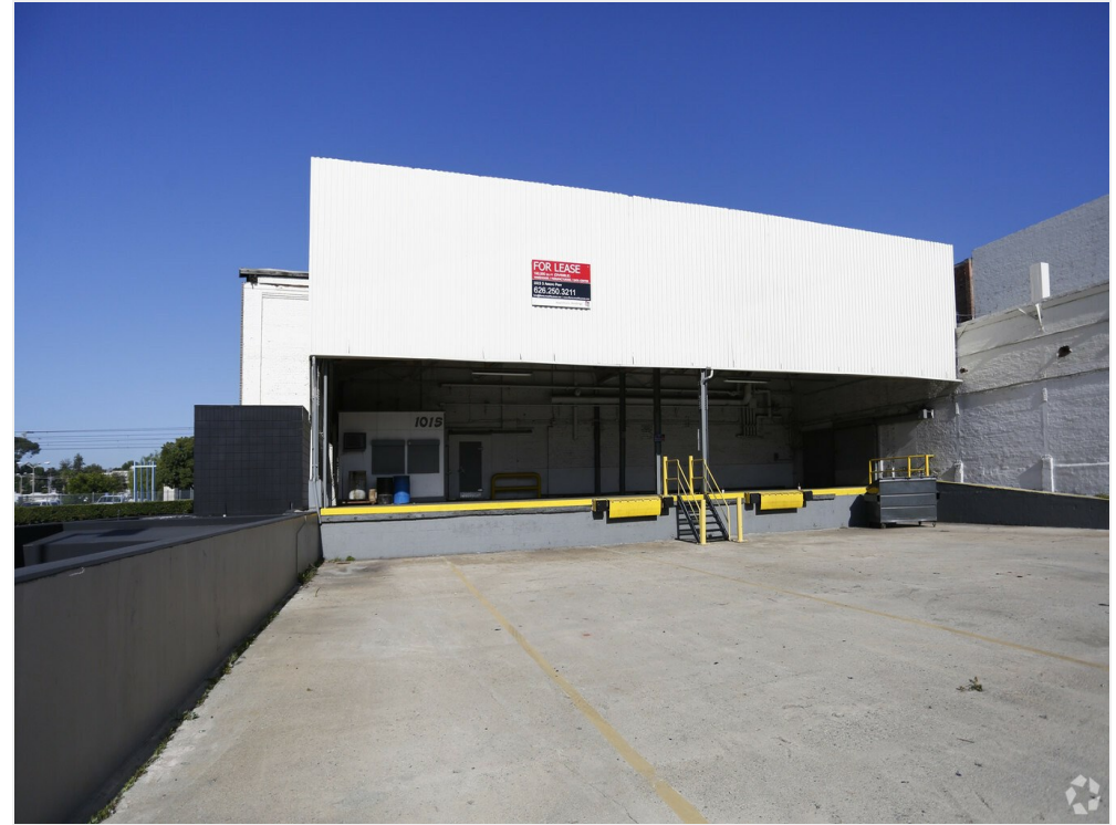
Main Loading Dock