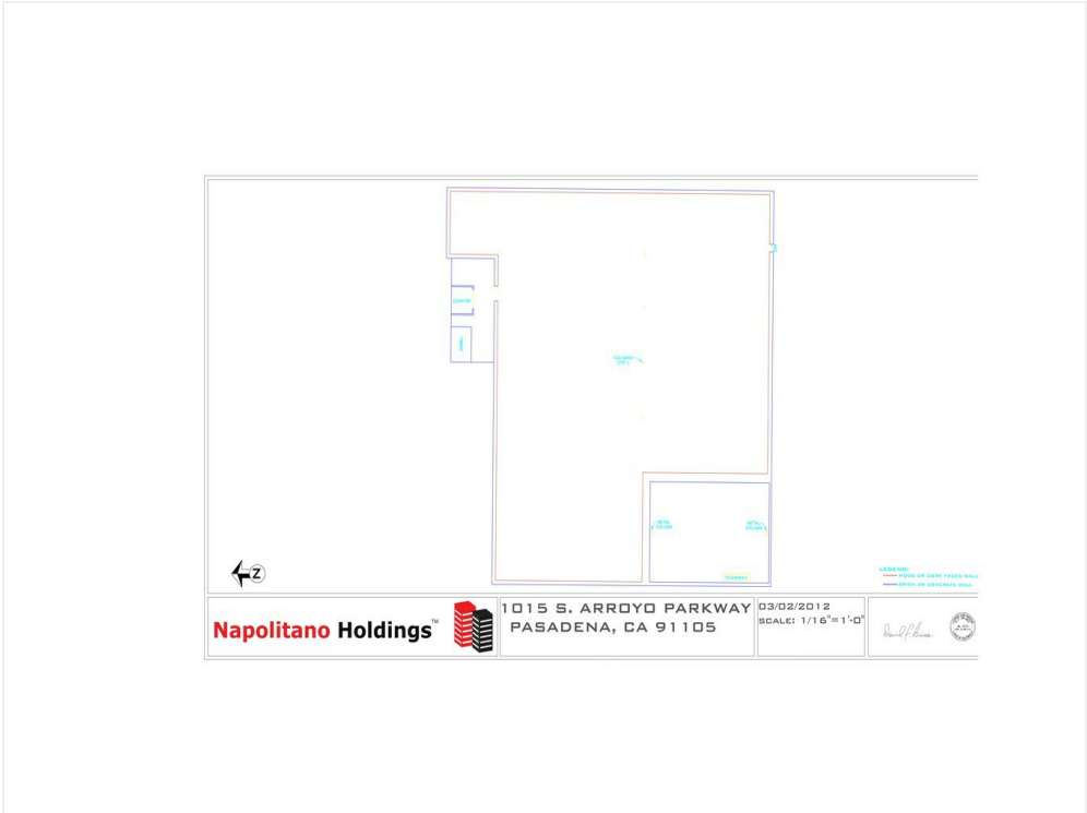
1015 S Arroyo Parkway 3rd Floor