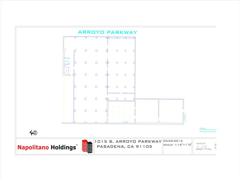
1015 S Arroyo Parkway 2nd Floor