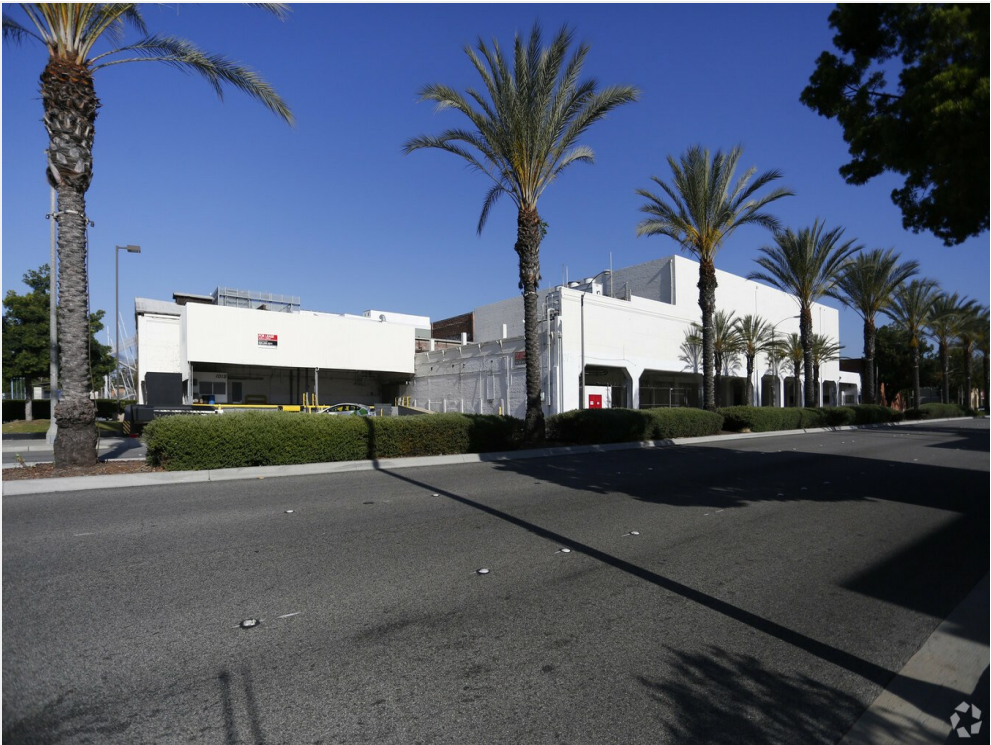
View From Across Arroyo Pkwy