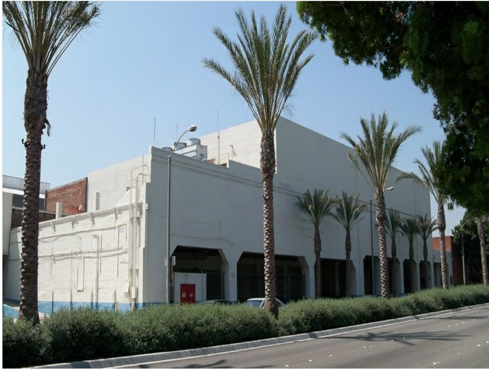
Arroyo Pkwy Overhang Area