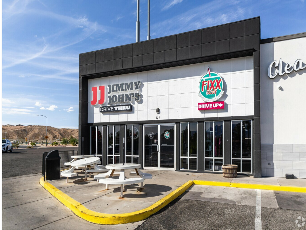
Jimmy John's - a National Tenant