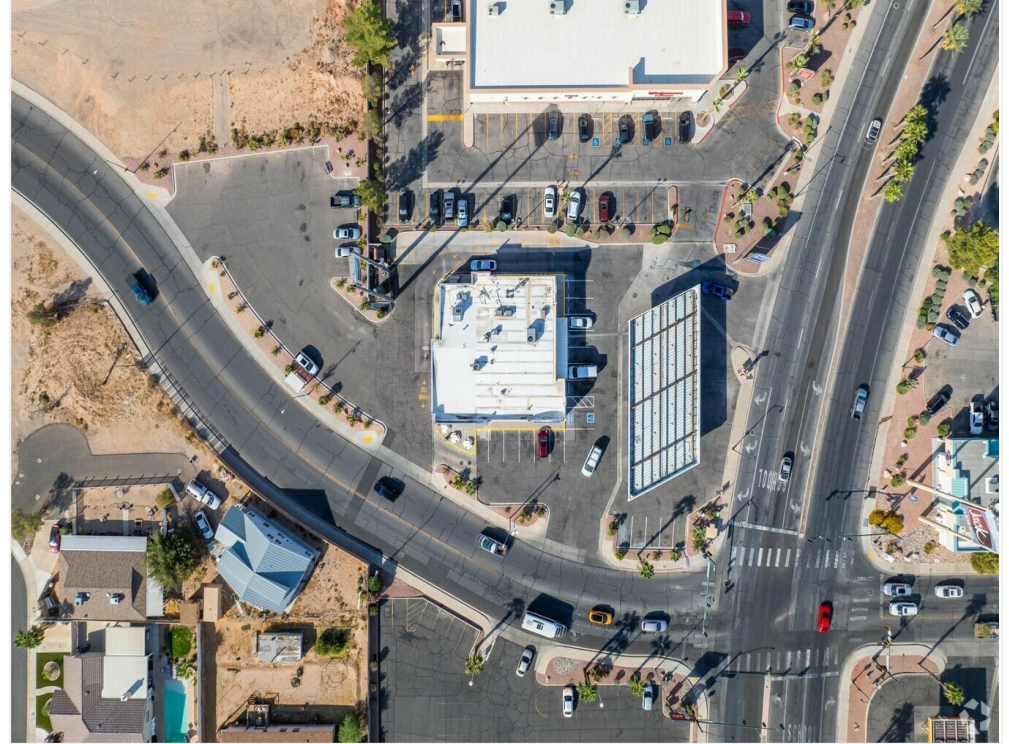
Intersection of Sandhill and E Old Mill