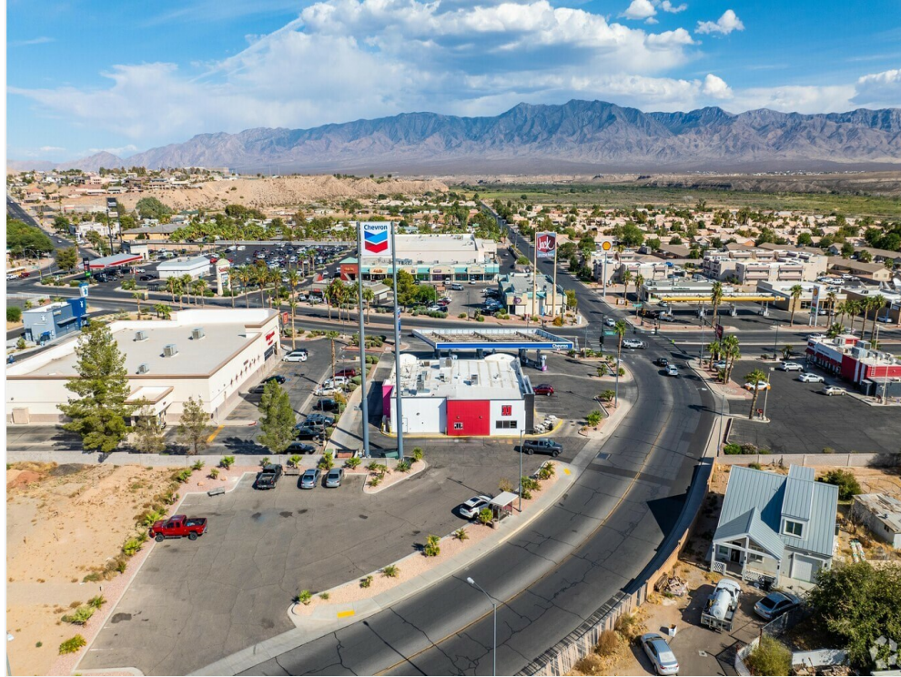
Intersection of Sandhill and E Old Mill