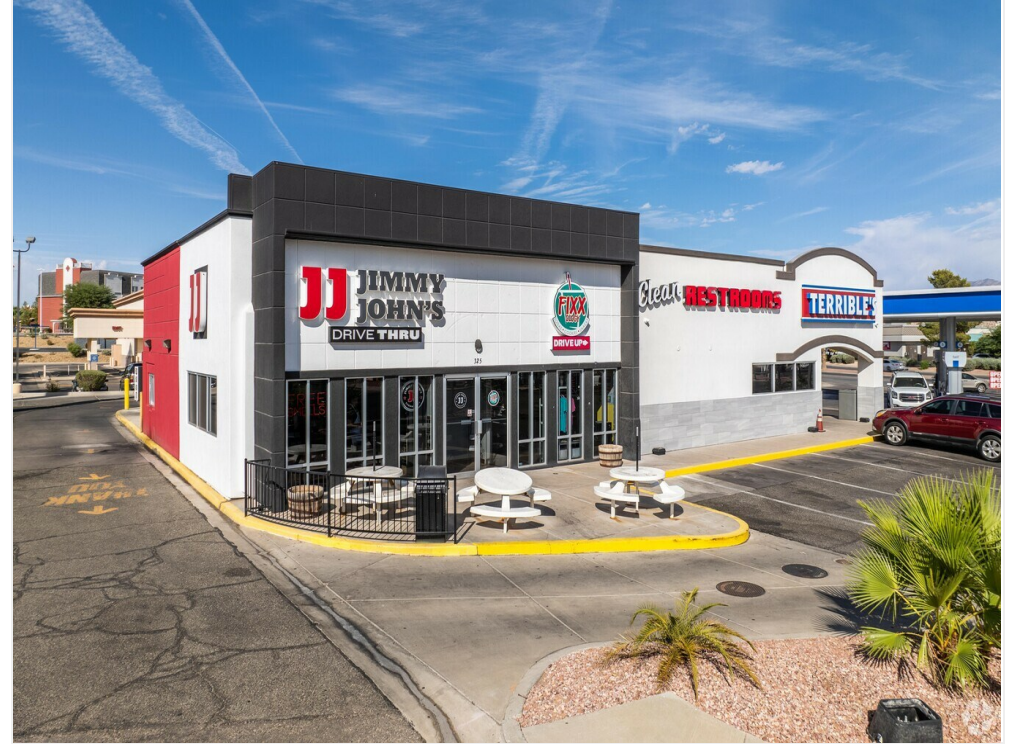
Jimmy John's - a National Tenant