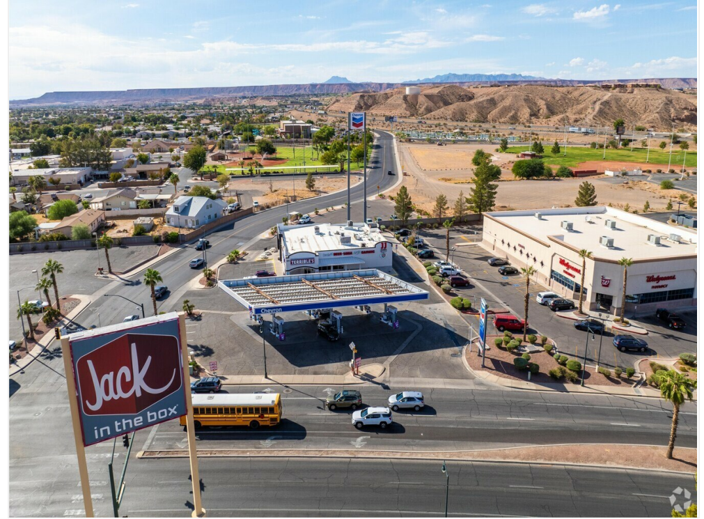
Surrounded by other National Tenants