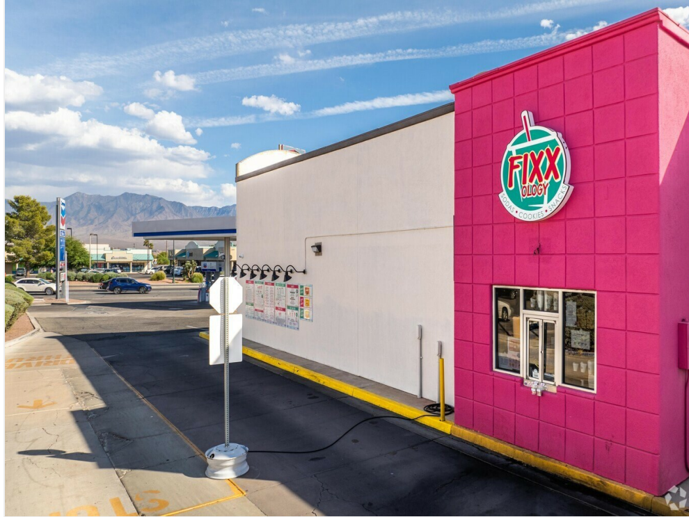
Drive Through 2 - Fixxology