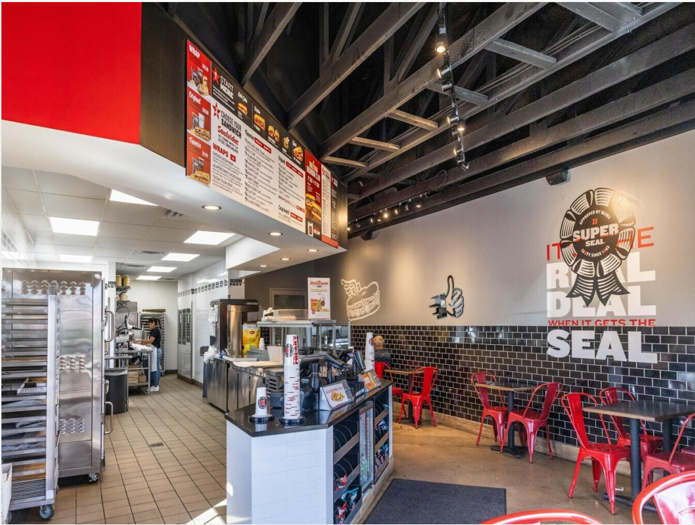
Jimmy Johns Entrance