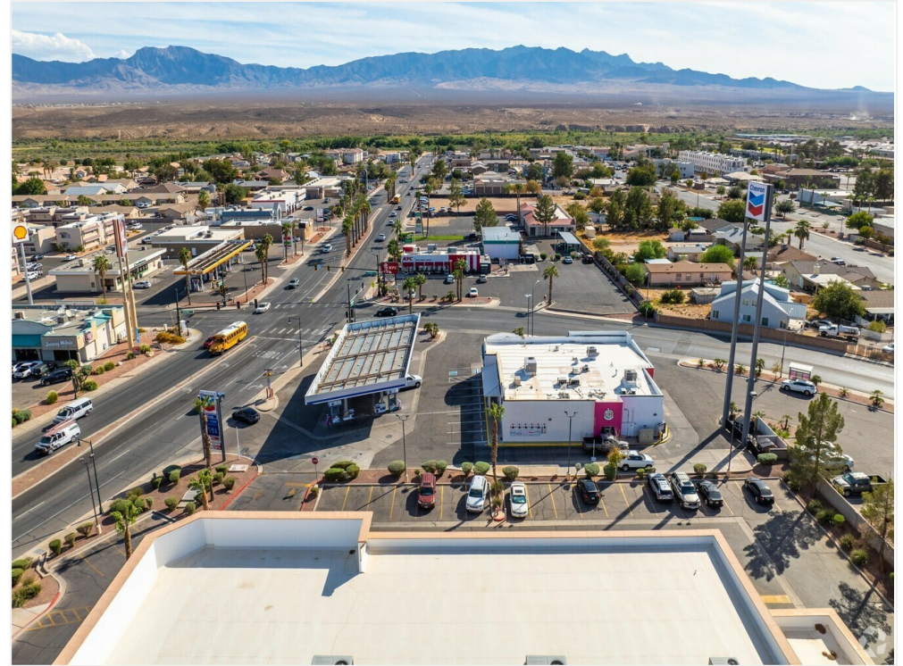
Intersection of Sandhill and E Old Mill