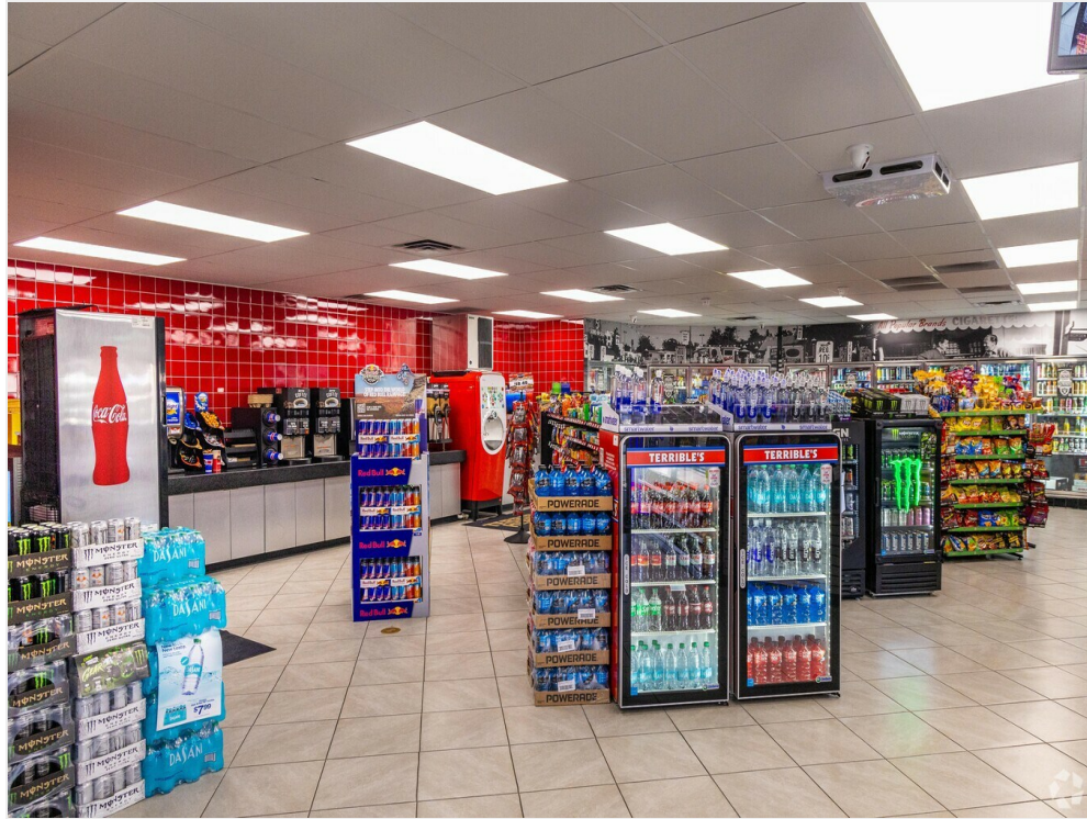
Terribles- Interior space