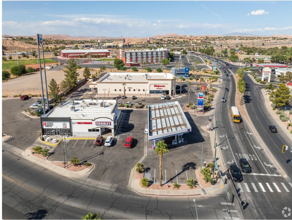
Intersection of Sandhill and E Old Mill