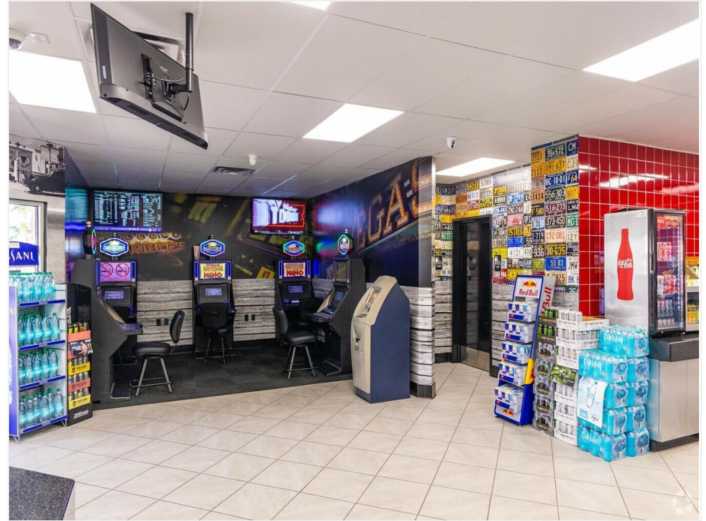
Terribles- Interior space