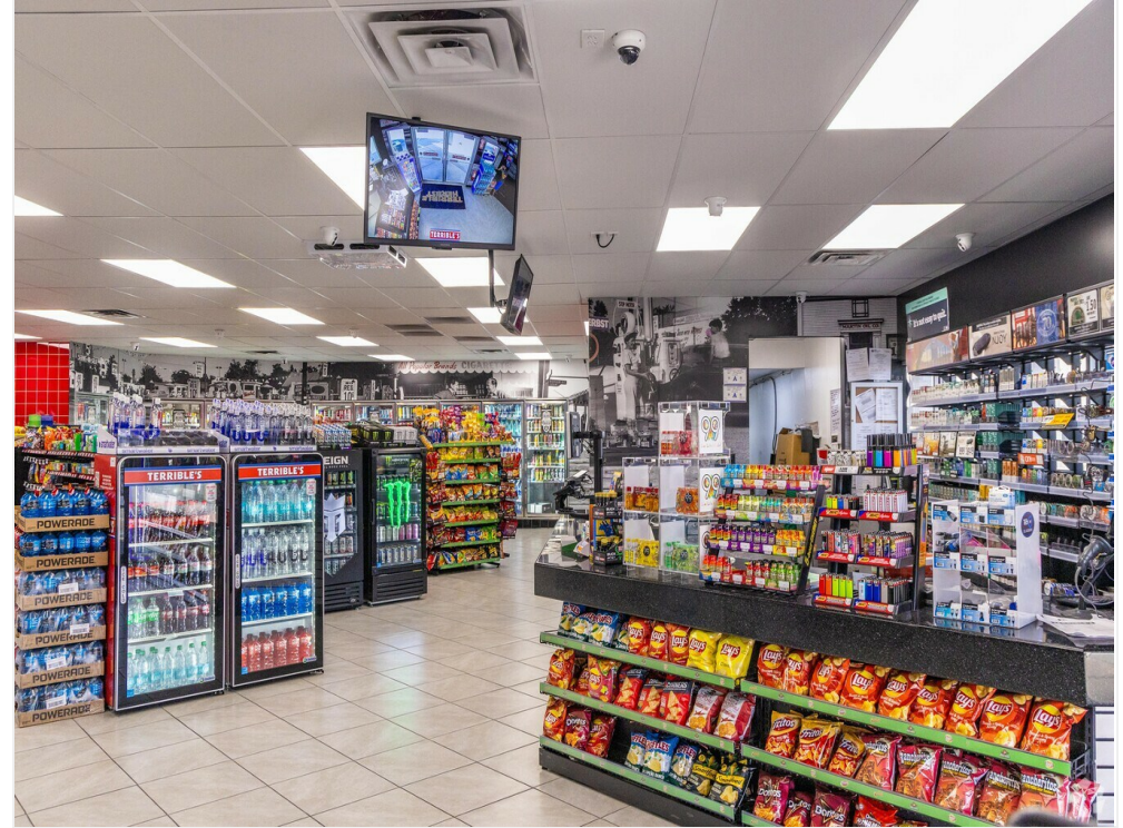
Terribles- Another National Tenant