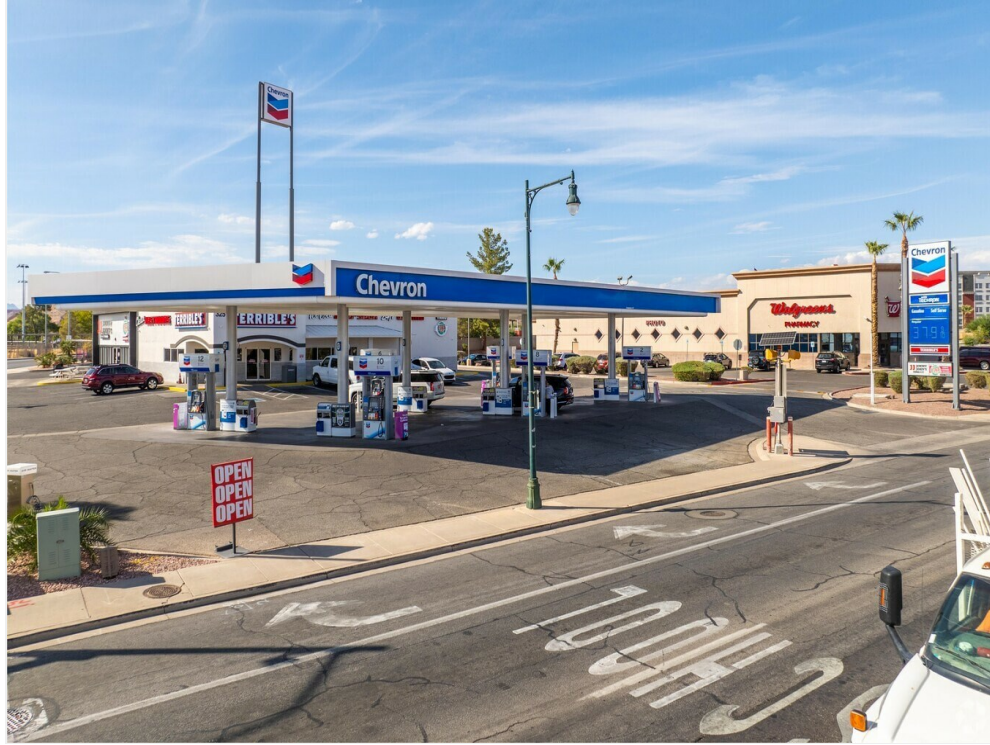
Property Entrance - Includes 2 national tenants