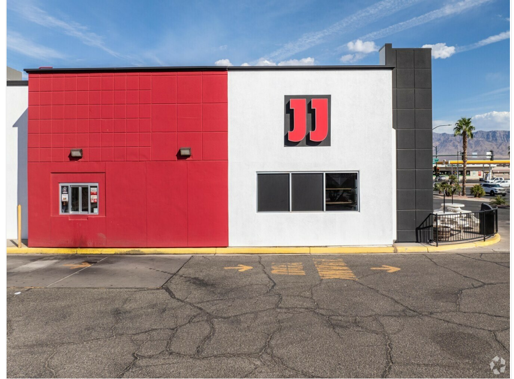
Jimmy Johns Drive Thru