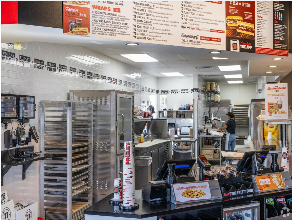
Jimmy Johns Kitchen