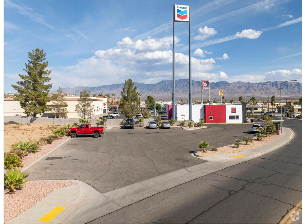
Tallest Signage in the area - Back parking lot and entrance