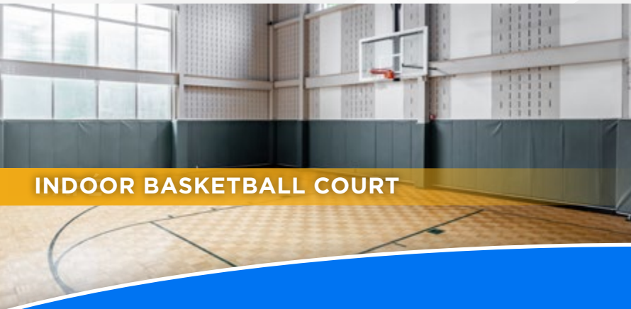
INDOOR BASKETBALL COURT