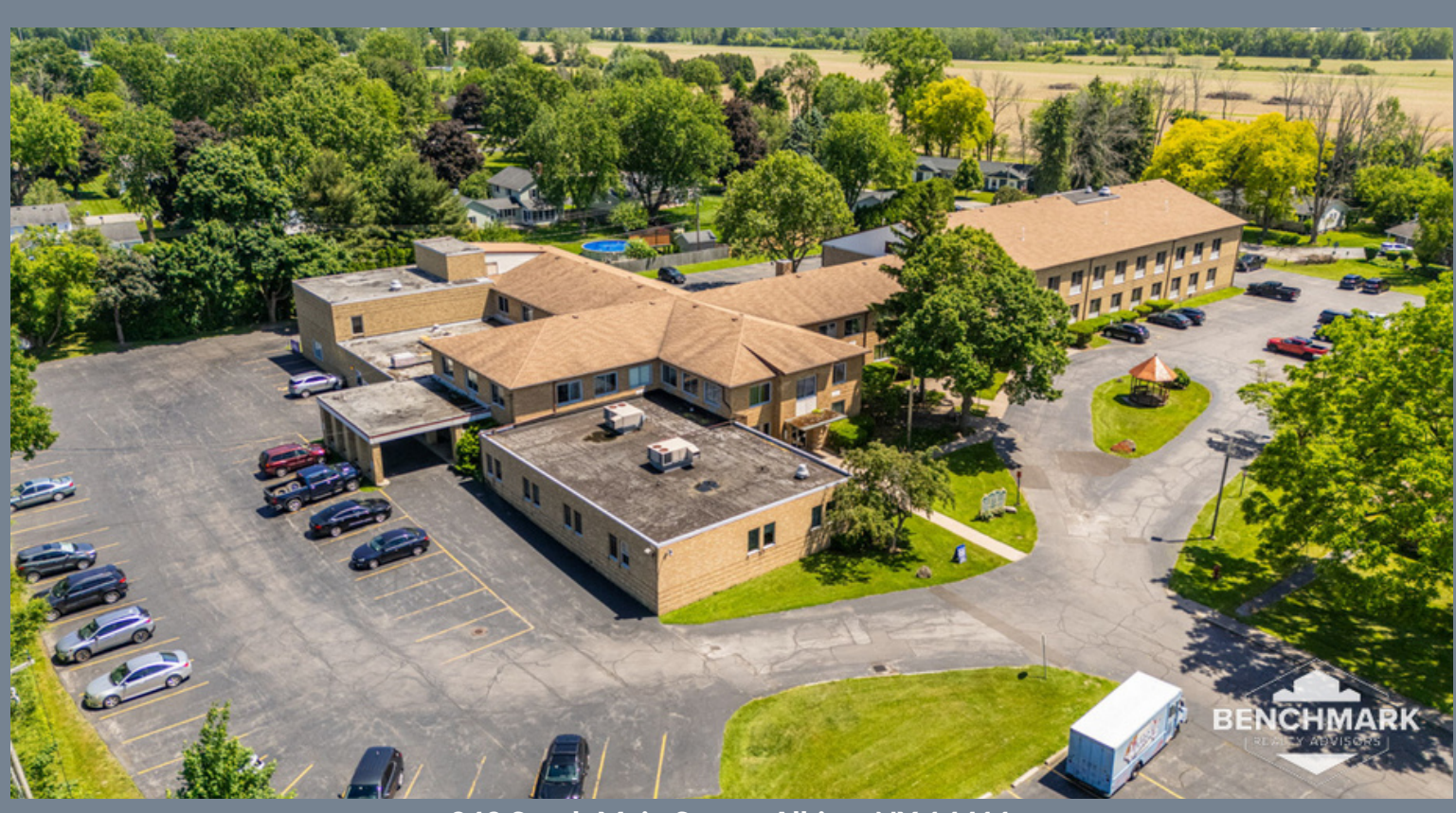
243 South Main Street, Albion, NY 14411