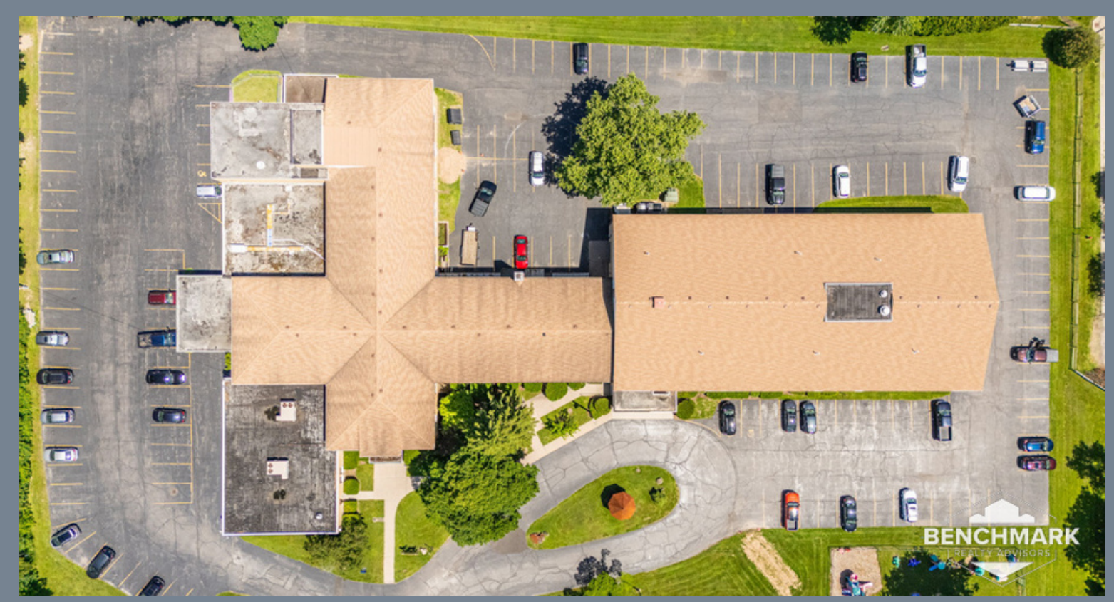
243 South Main Street, Albion, NY 14411