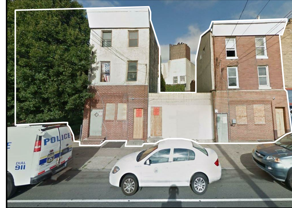
3. FRANKFORD AVE. FRONT FACADE