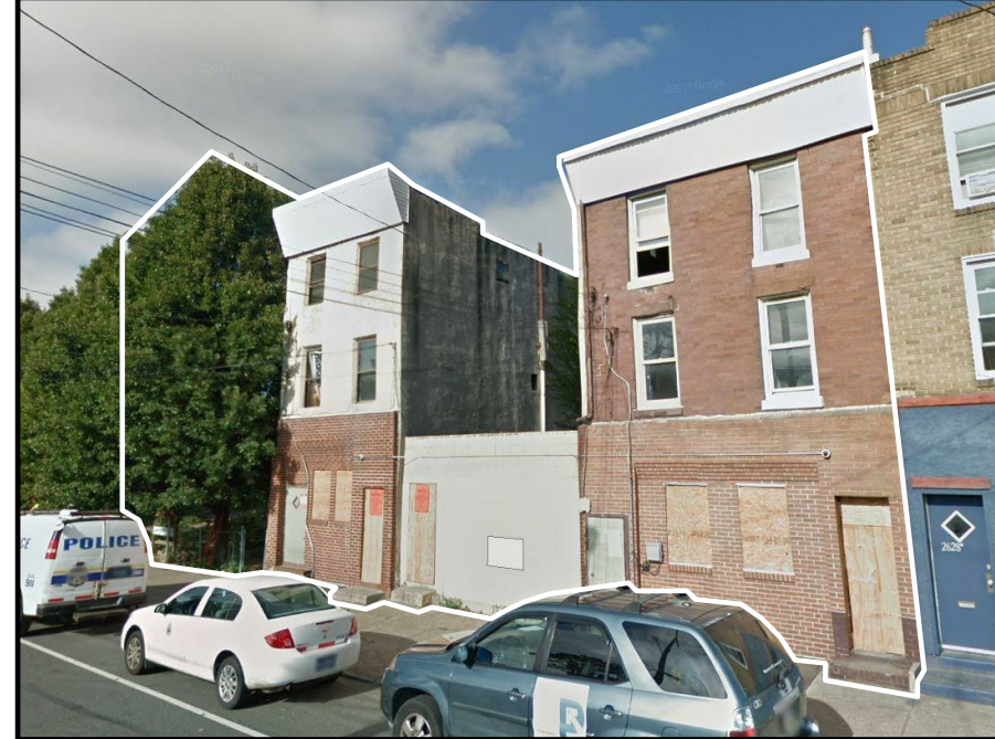
1. FRANKFORD AVE. VIEW LOOKING SOUTH