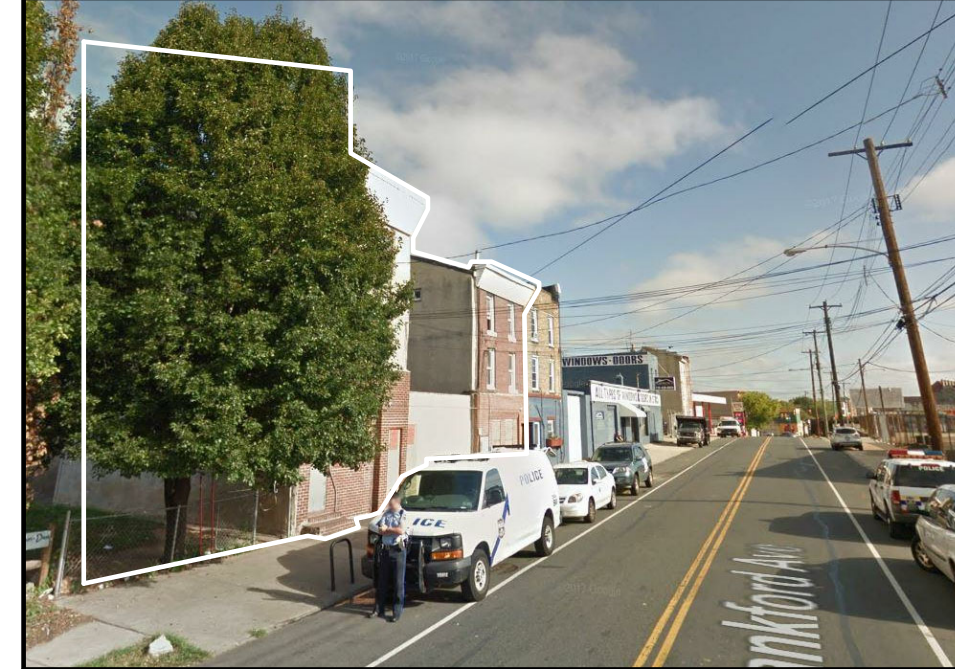
2. FRANKFORD AVE. VIEW LOOKING NORTH