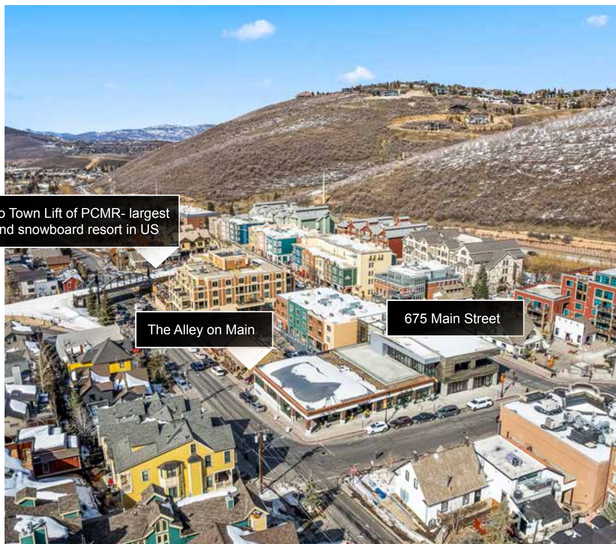
The Alley on Main