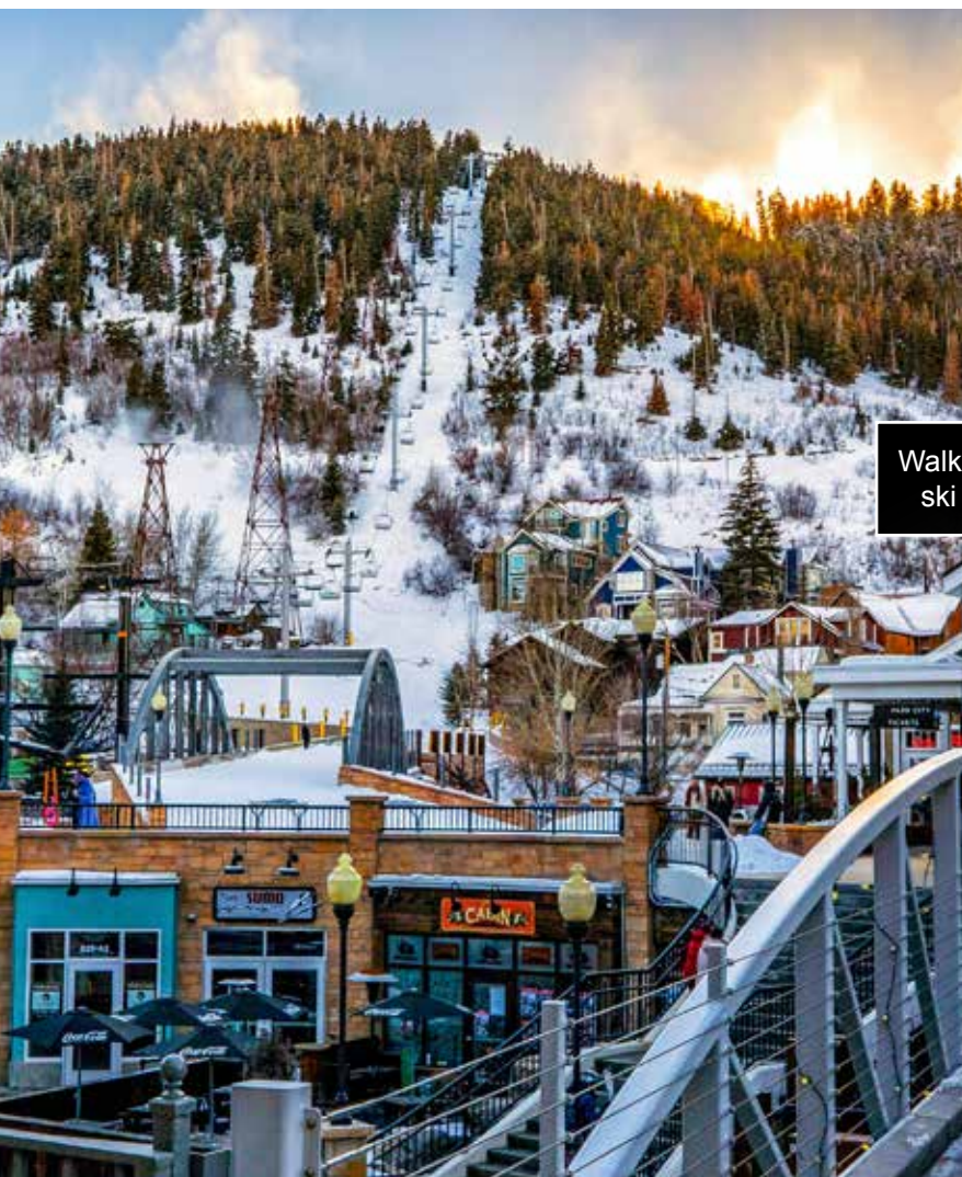
Walk to Town Lift of PCMR- largest ski and snowboard resort in US

OLD TOWN 675 MAIN STREET | PARK CITY, UTAH 84060