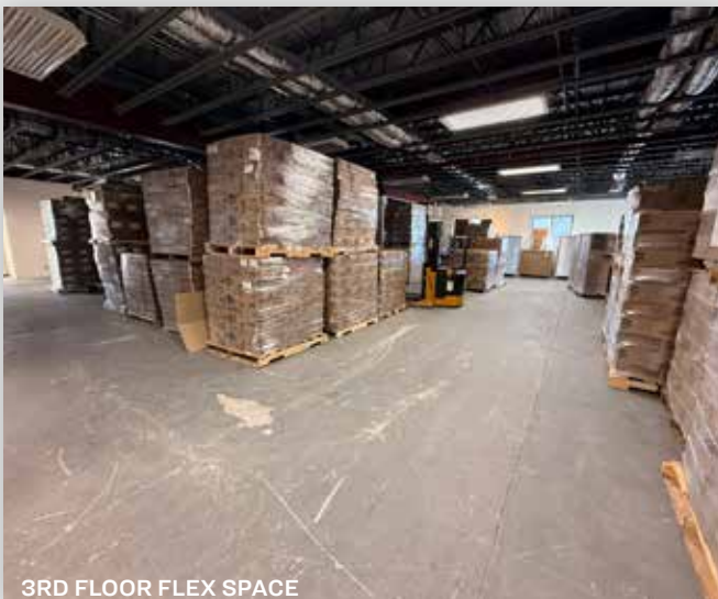
3RD FLOOR FLEX SPACE