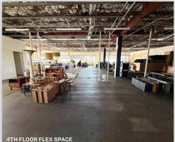
4TH FLOOR FLEX SPACE