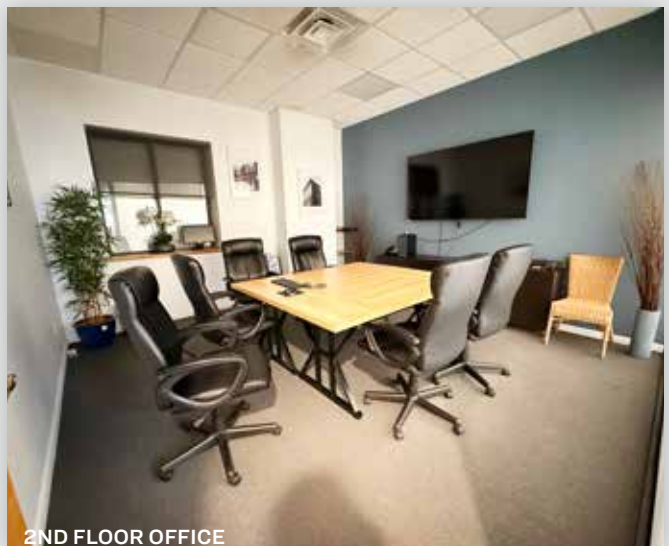
2ND FLOOR OFFICE