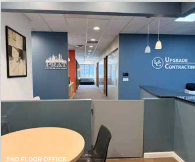
2ND FLOOR OFFICE