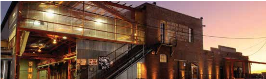
Warehouse District - 0.9