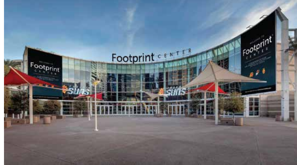
Footprint Center - 0.9 miles