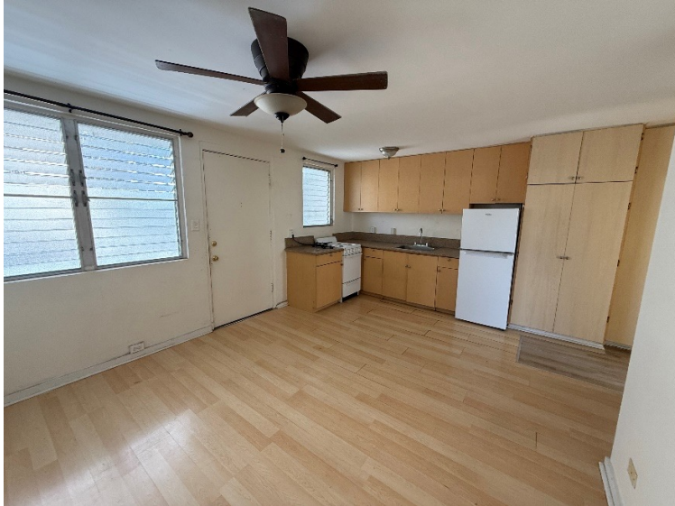
Living Room / Kitchen

For Sale Kinau Street Apartment Building