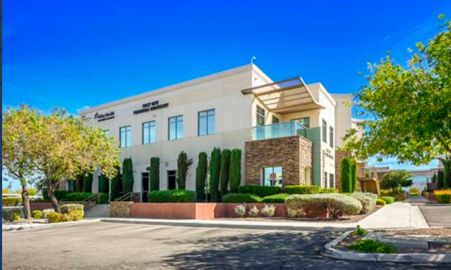
866 SEVEN HILLS DRIVE HENDERSON, NV 89052

For additional medical leasing opportunities see our additional listings that are owned and managed by affiliates of Woodside Health: