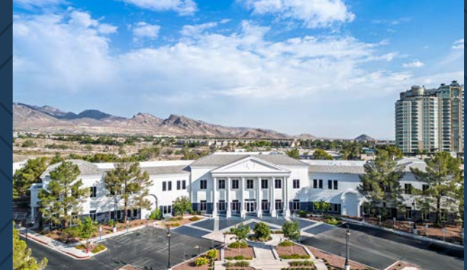
851 S. RAMPART BLVD LAS VEGAS, NV 89145