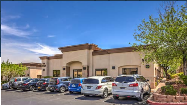
9029 S. PECOS ROAD HENDERSON, NV 89074