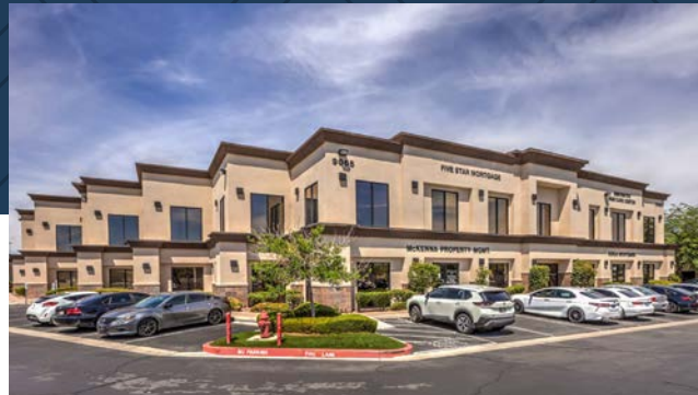
9065 S. PECOS ROAD HENDERSON, NV 89074

Since 2008, Woodside Health has grown to become one of the premier healthcare real estate private equity firms. Our primary focus is acquiring and managing healthcare buildings, recognizing the critical role that real estate plays in delivering high-quality healthcare services.