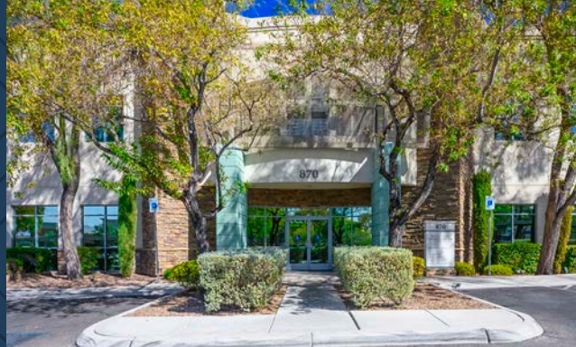
870 SEVEN HILLS DRIVE HENDERSON, NV 89052