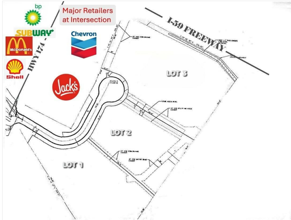
Engineer Print 03.17.26