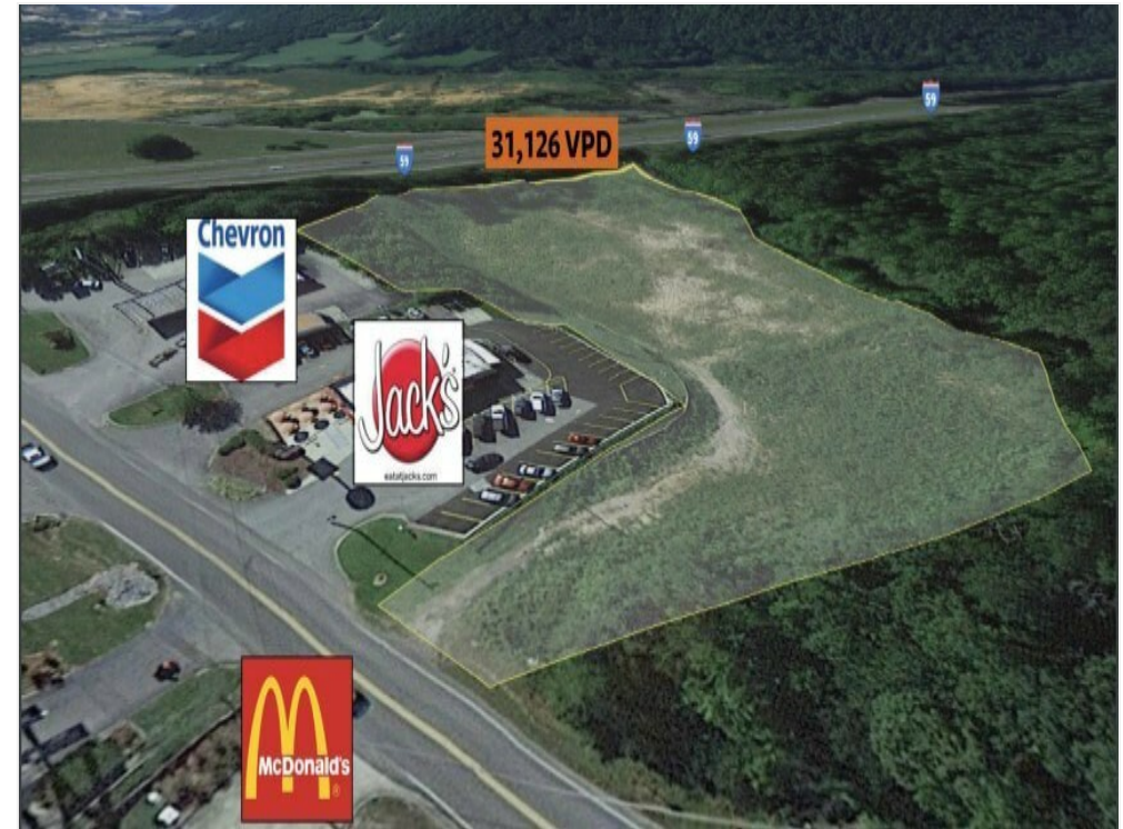
Adjacent Retail Stores