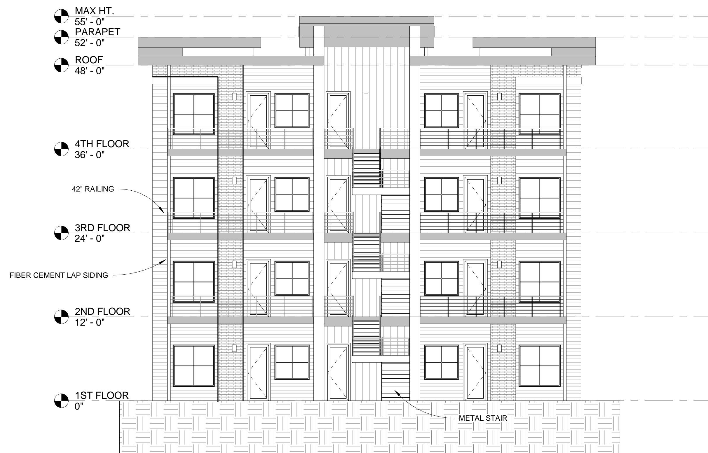
3 SIDNEY ST. ELEVATION SCALE 1/8" = 1'-0"