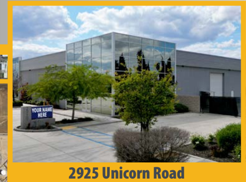
2925 Unicorn Road

2925 Unicorn Road ■ Suites A & B ■ Bakersfield, CA