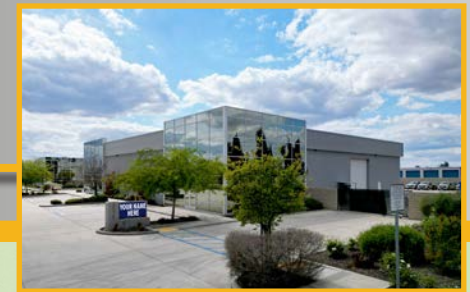
2925 Unicorn Road

2925 Unicorn Road ■ Suites A & B ■ Bakersfield, CA