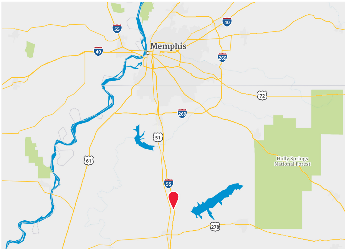
Proximity to Memphis MSA via I-55

The building’s size, infrastructure, and accessibility position it as an efficient solution for users seeking economical space within the Memphis logistics network and labor base. The majority of the building is currently leased, providing in-place income through February 2027.