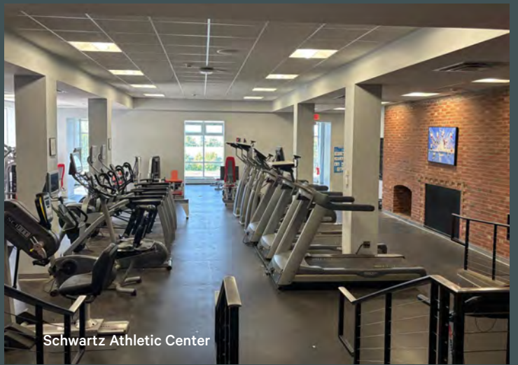
Schwartz Athletic Center