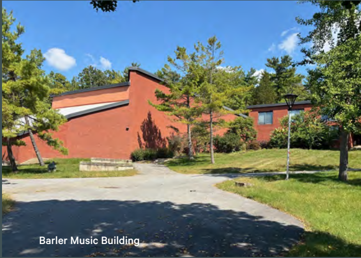
Barler Music Building