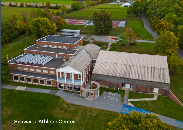
Schwartz Athletic Center