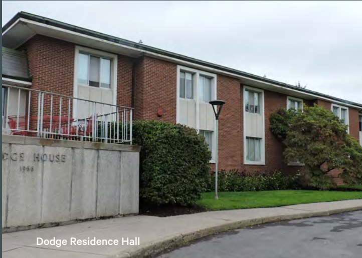
Dodge Residence Hall