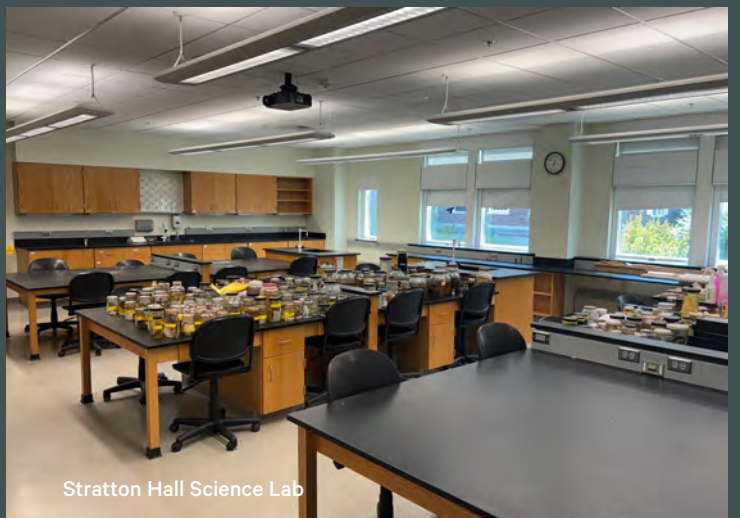
Stratton Hall Science Lab