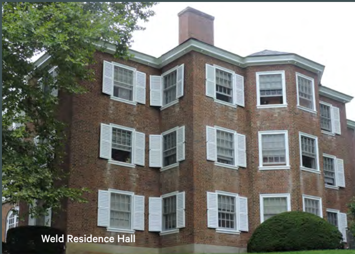
Weld Residence Hall