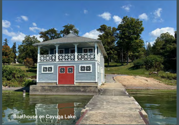
Boathouse on Cayuga Lake