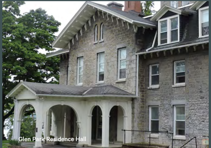
Glen Park Residence Hall