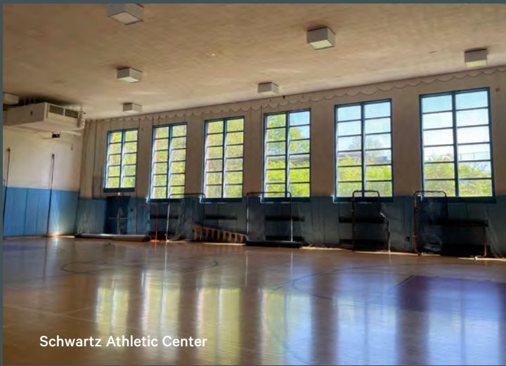
Schwartz Athletic Center