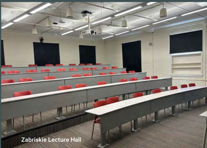
Zabriskie Lecture Hall