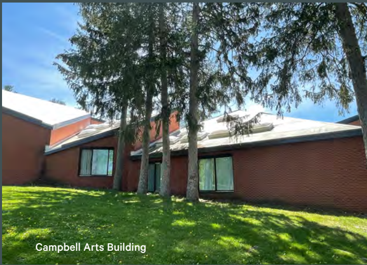
Campbell Arts Building