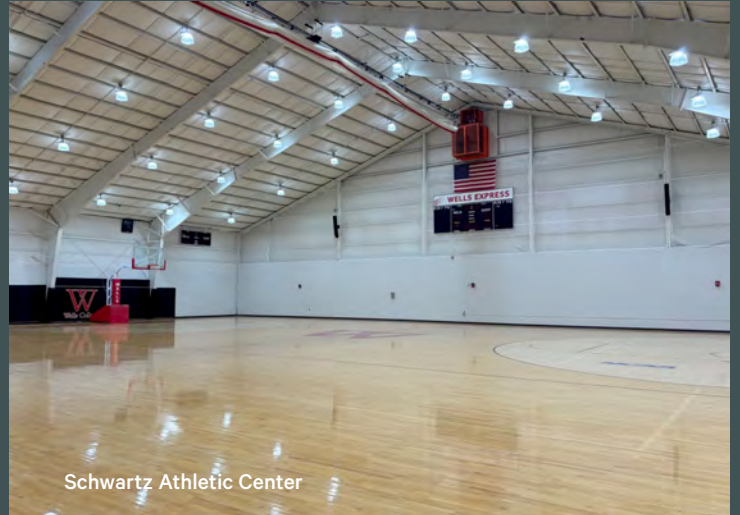
Schwartz Athletic Center