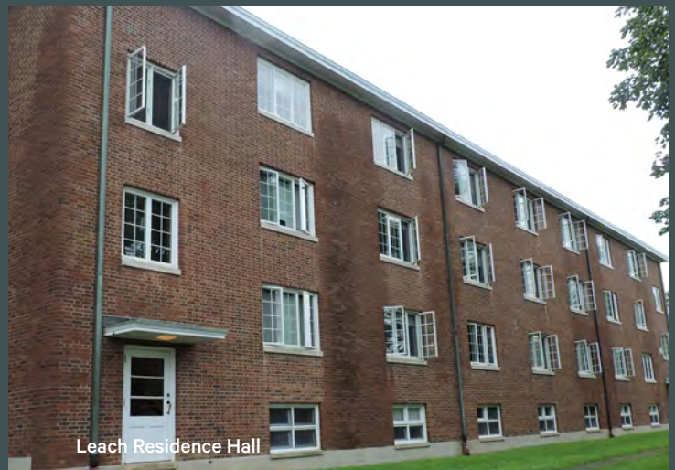
Leach Residence Hall