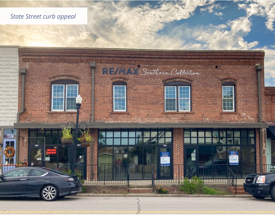
State Street curb appeal