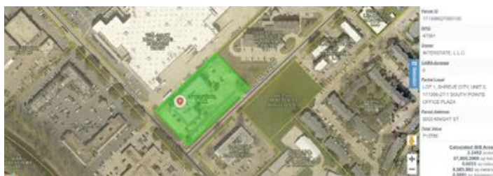
3003 Knight St Aerial