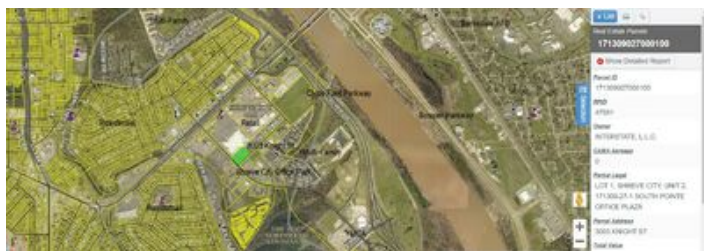
3003 Knight St Neighborhood Aerial