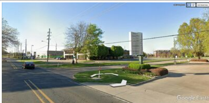
3003 Knight St Approach