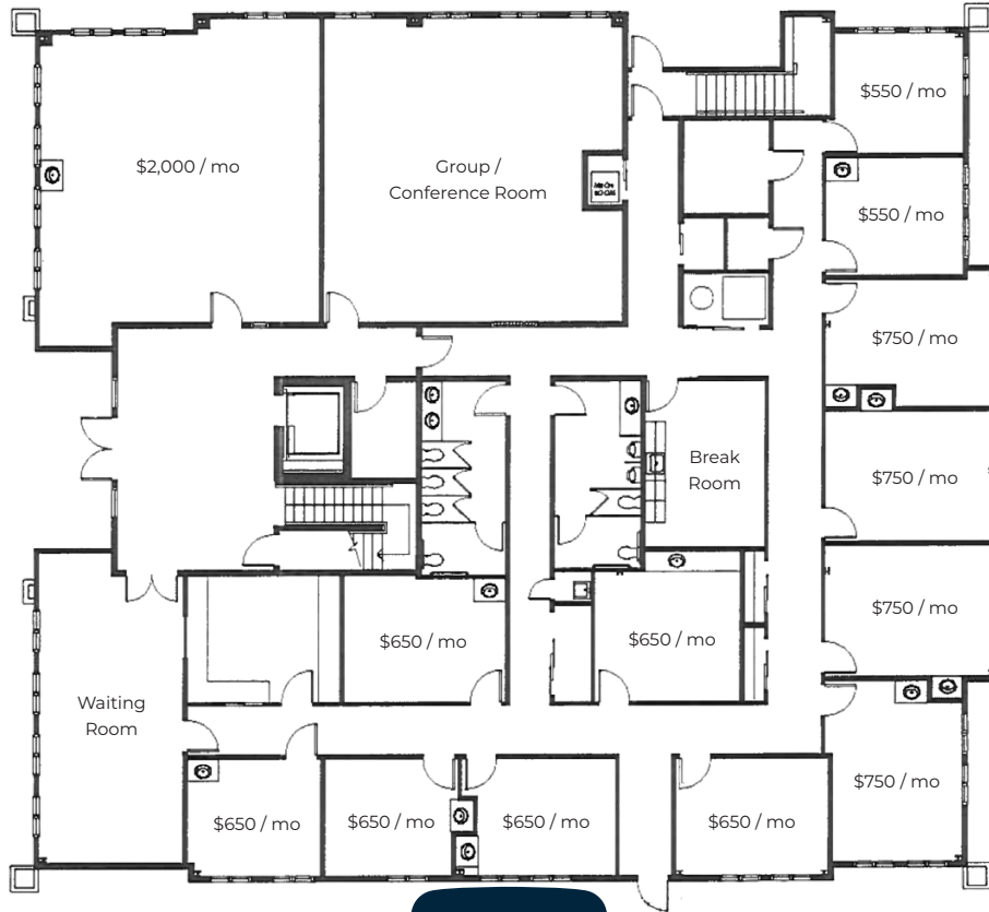
Level 1 Floor Plan 7,284 sq. ft.