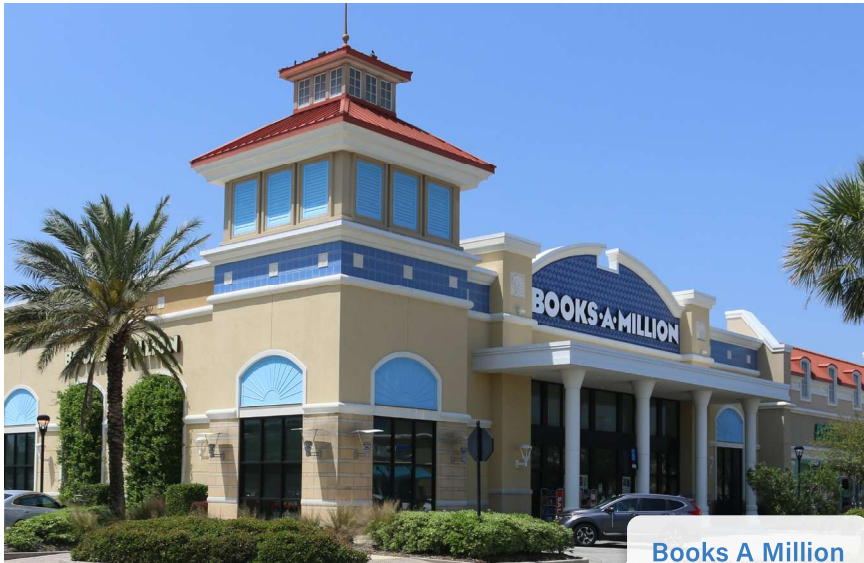
Books A Million

3800 Gulf Shores Pkwy, Gulf Shores, AL 36542