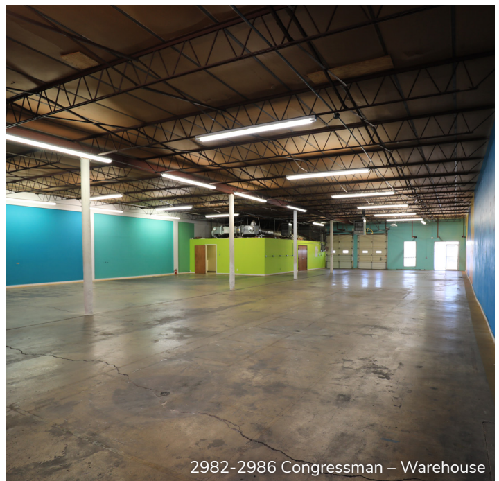
2982-2986 Congressman - Warehouse