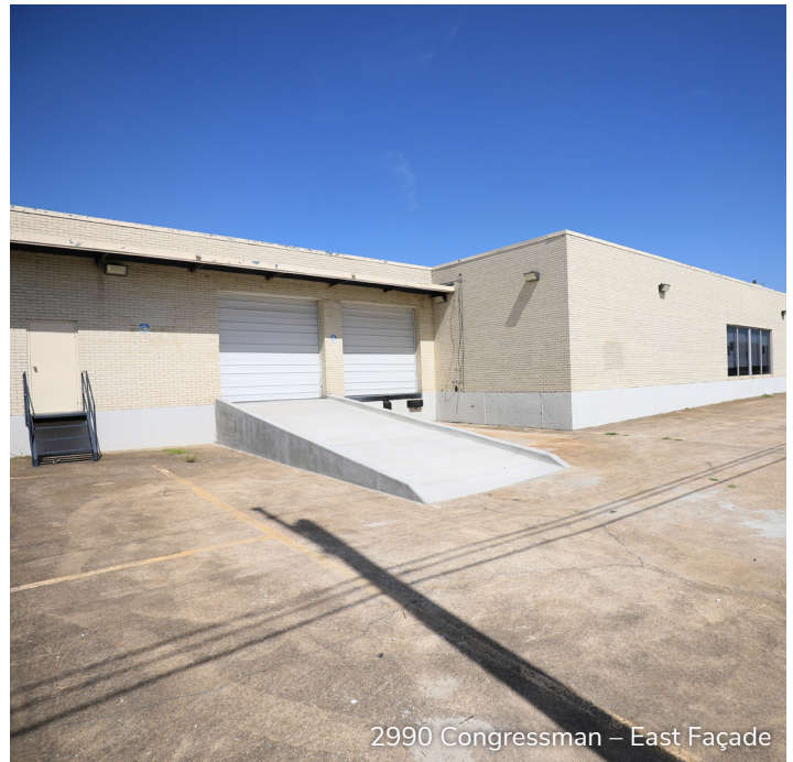
2990 Congressman - East Façade