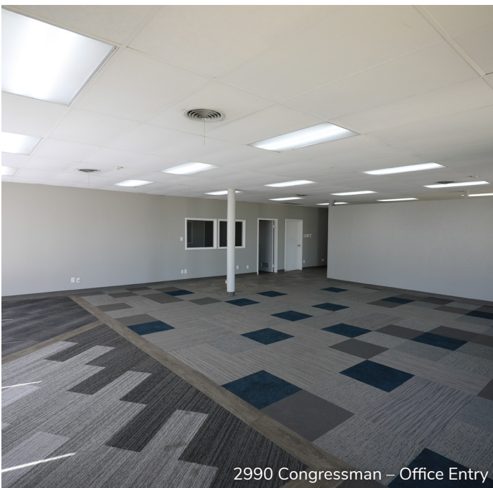
2990 Congressman - Office Entry