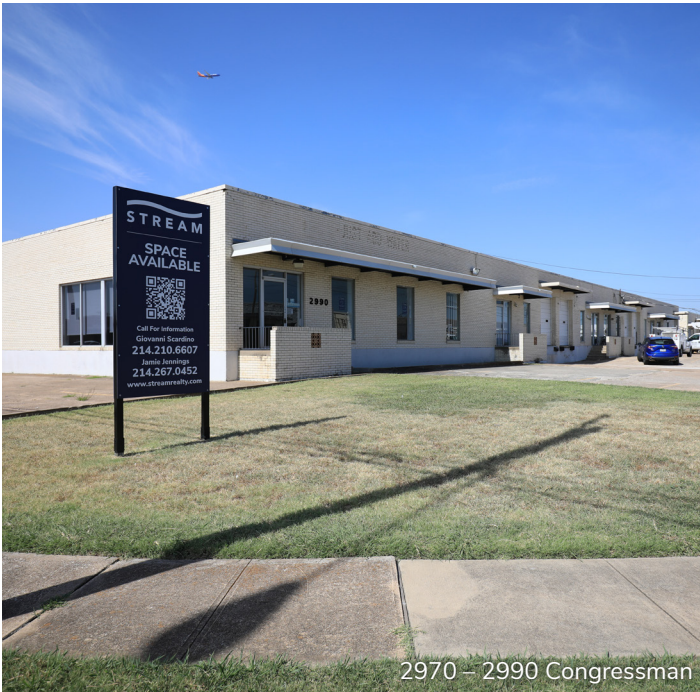
2970 - 2990 Congressman