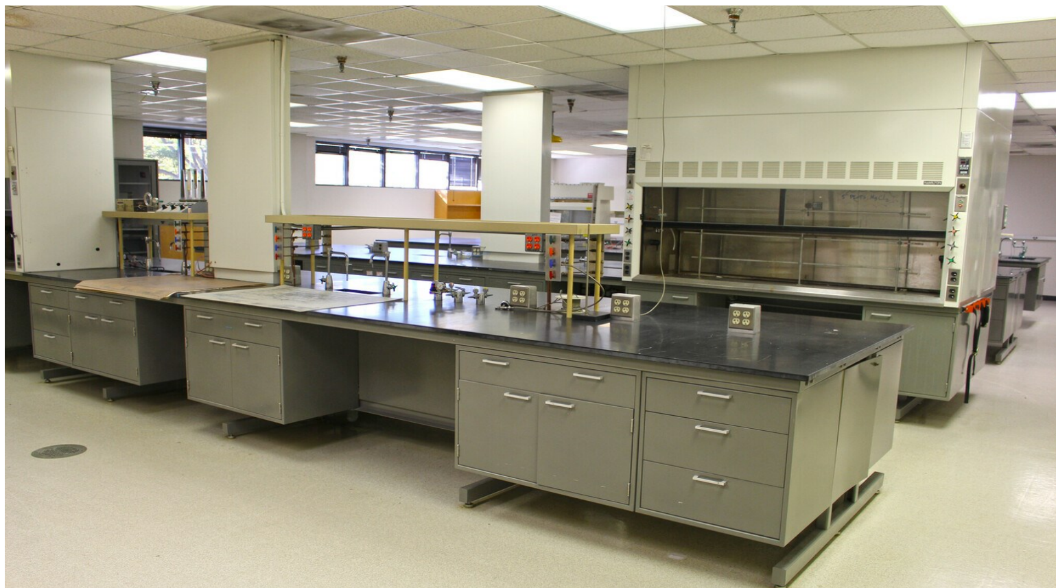
Other Lbas 2