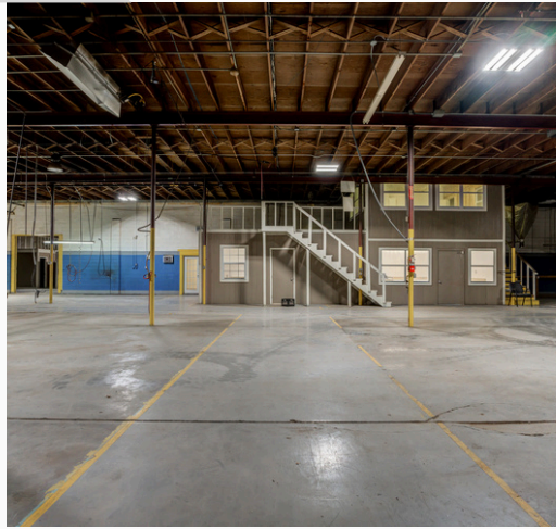
Ready for Business