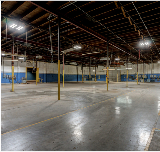
Open Span & Overhead Doors