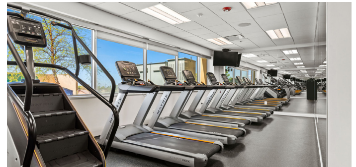
Fitness Center ■