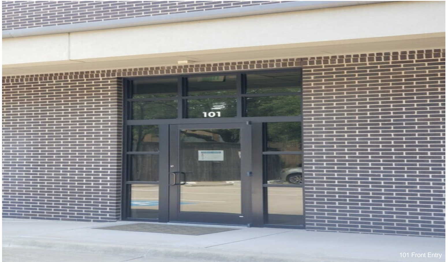
101 Front Entry