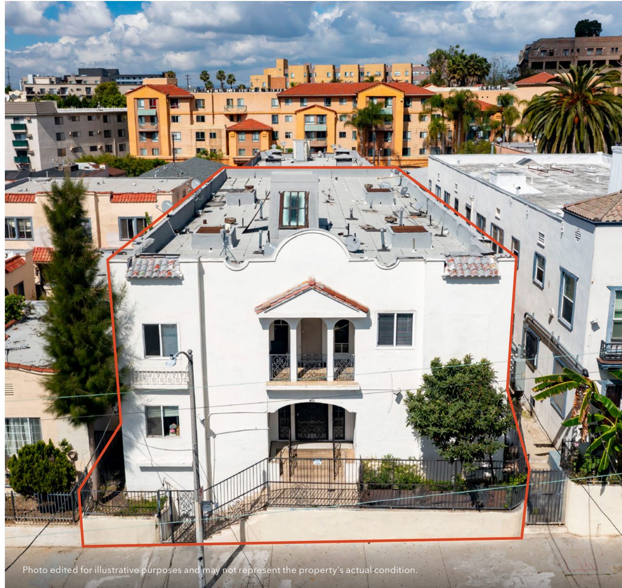
Photo edited for illustrative purposes and may not represent the property's actual condition.