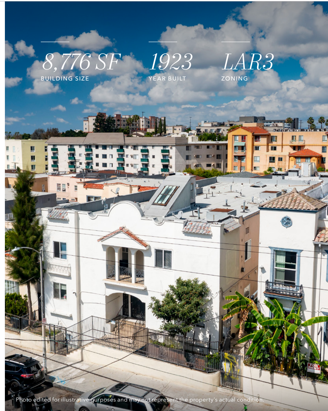
Photo edited for illustrative purposes and may not represent the property's actual condition.

Contact Casey Lins at 714.333.6768 or Casey.Lins@kidder.com for additional information.