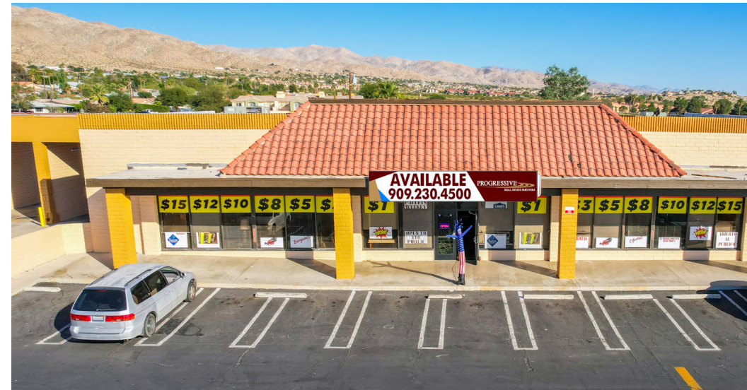
8,000 SF Junior Anchor End Cap Space

This center checks every box for a tenant success. Highly trafficked intersection of Palm Drive and Hacienda Avenue is the Main & Main of Desert Hot Springs. Easy access loads of parking, and 360 degrees of rooftops combined with freshly painted modern color scheme and pristine parking lot just slurry coated and newly striped.