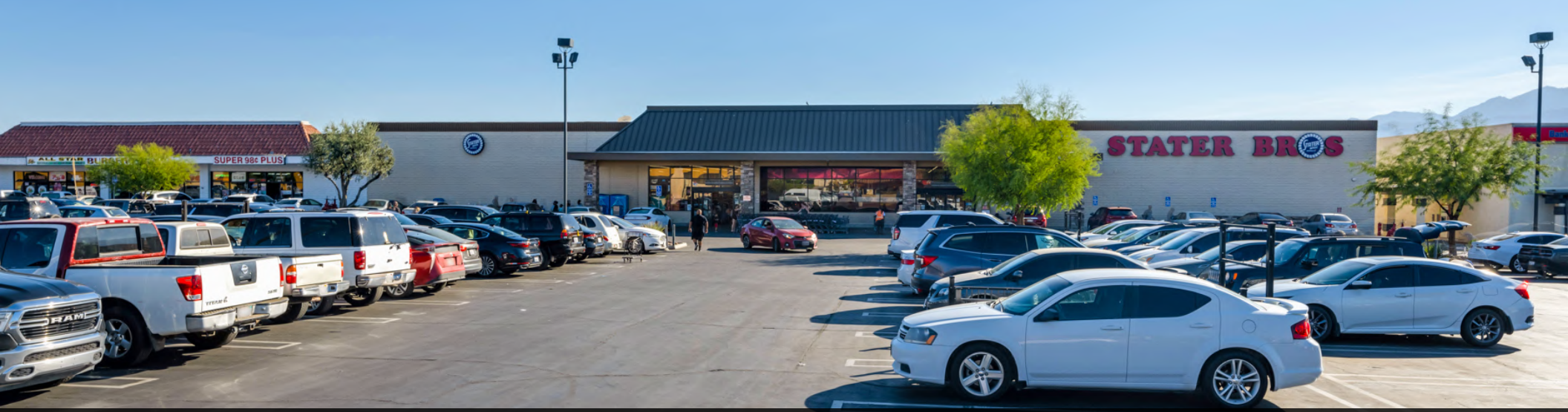
Stater Bros. Markets