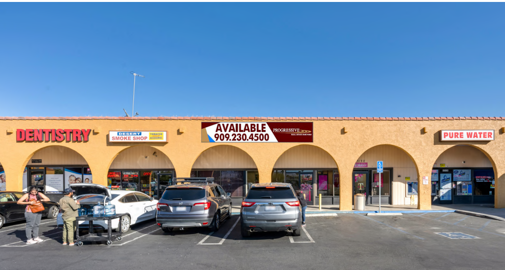
2,500 SF Available Space