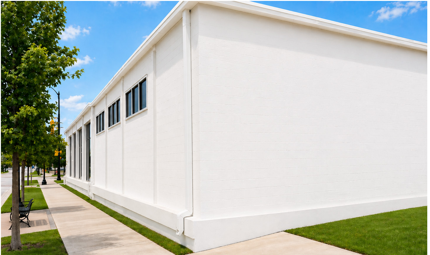
Conceptual Rendering – 2312 Montgomery Street