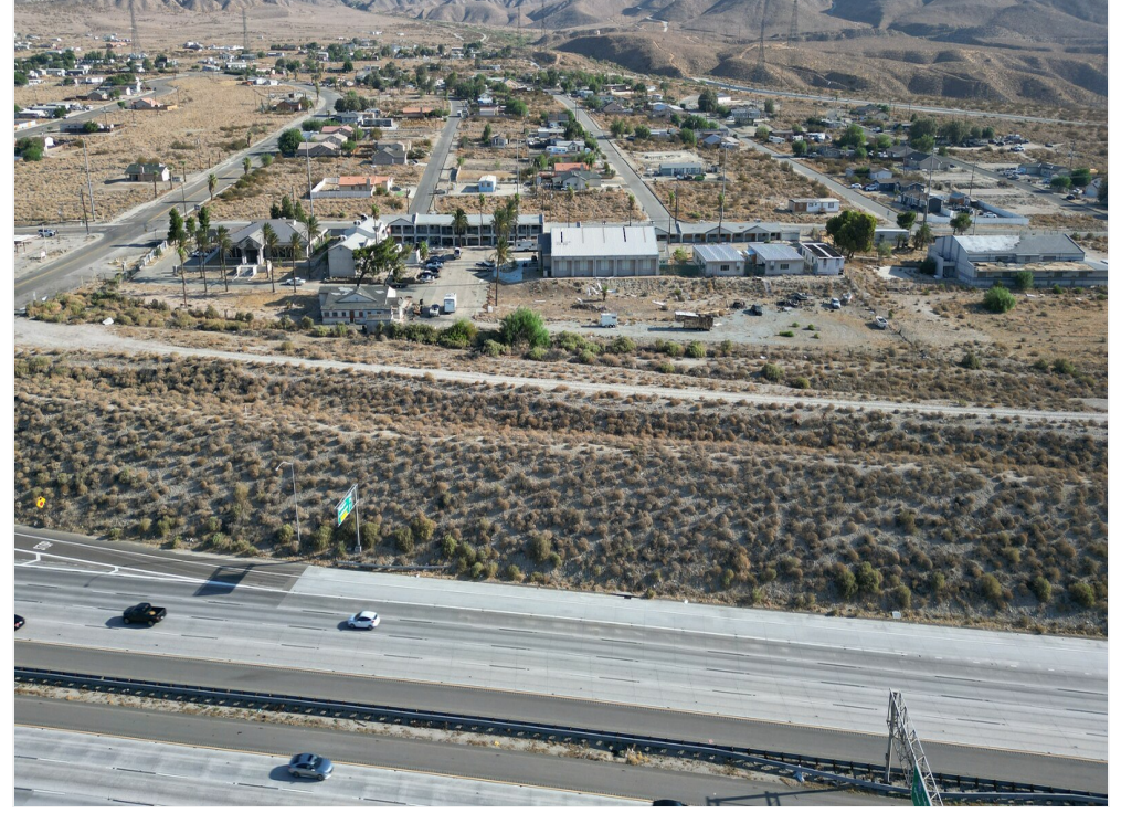
55860 Haugen Lehman way, Whitewater CA, 92282 1