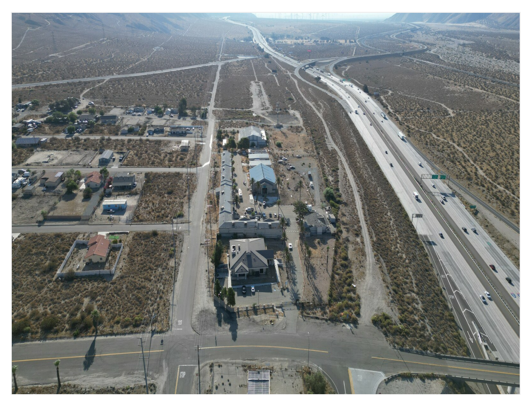
55860 Haugen Lehman way, Whitewater CA, 92282 9