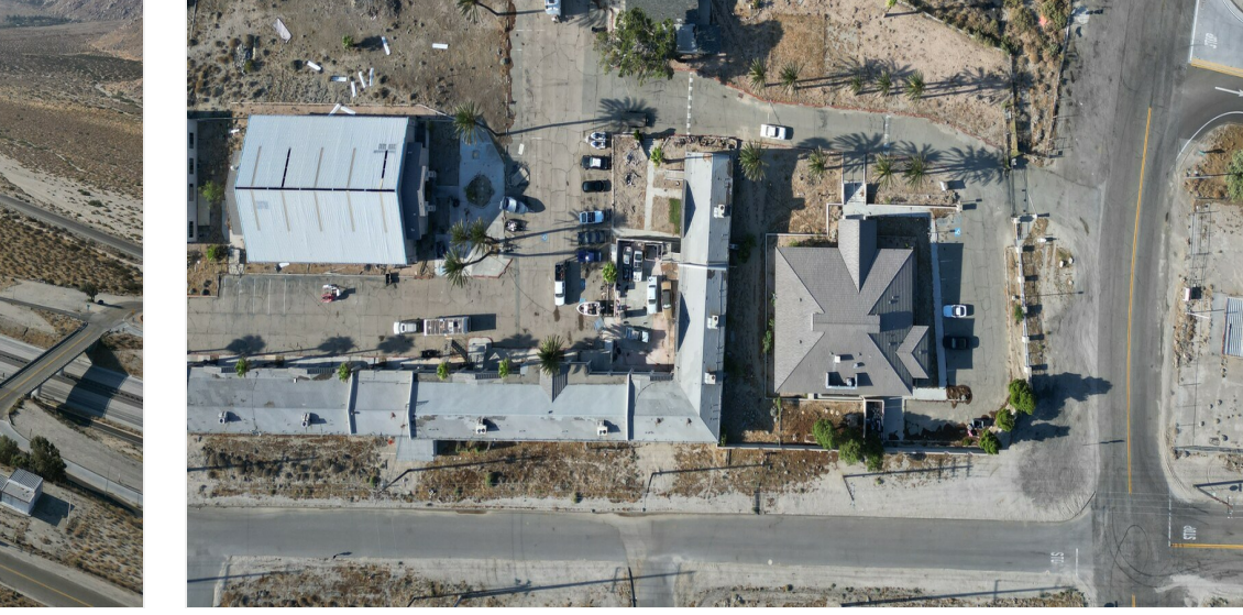
55860 Haugen Lehman way, Whitewater CA, 92282 18