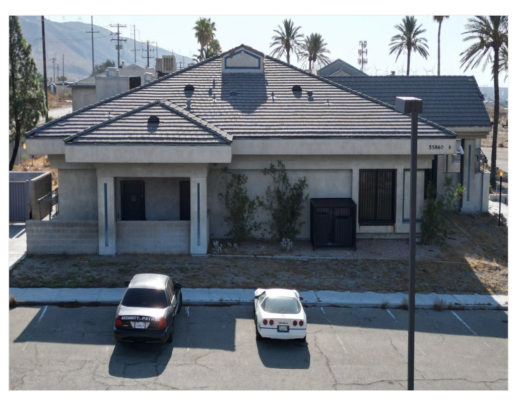
55860 Haugen Lehman way, Whitewater CA, 92282 25