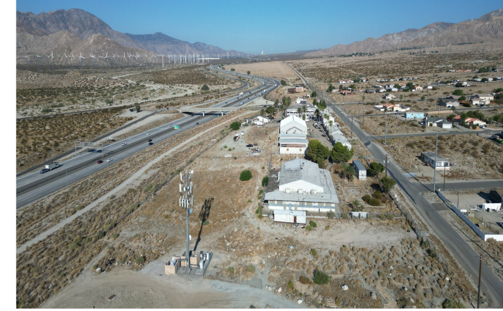
55860 Haugen Lehman way, Whitewater CA, 92282 3