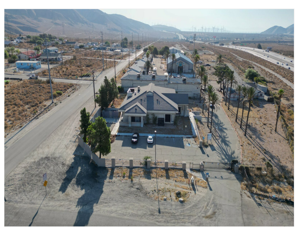
North Side Aerial