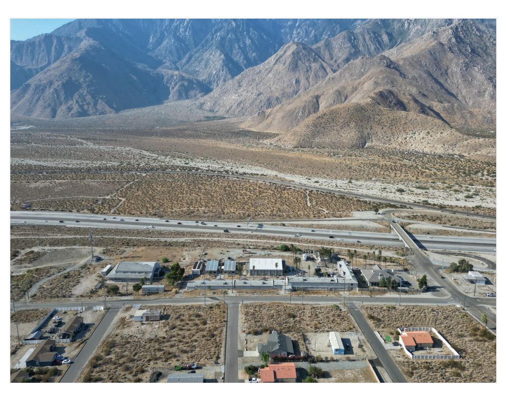
55860 Haugen Lehman way, Whitewater CA, 92282 16