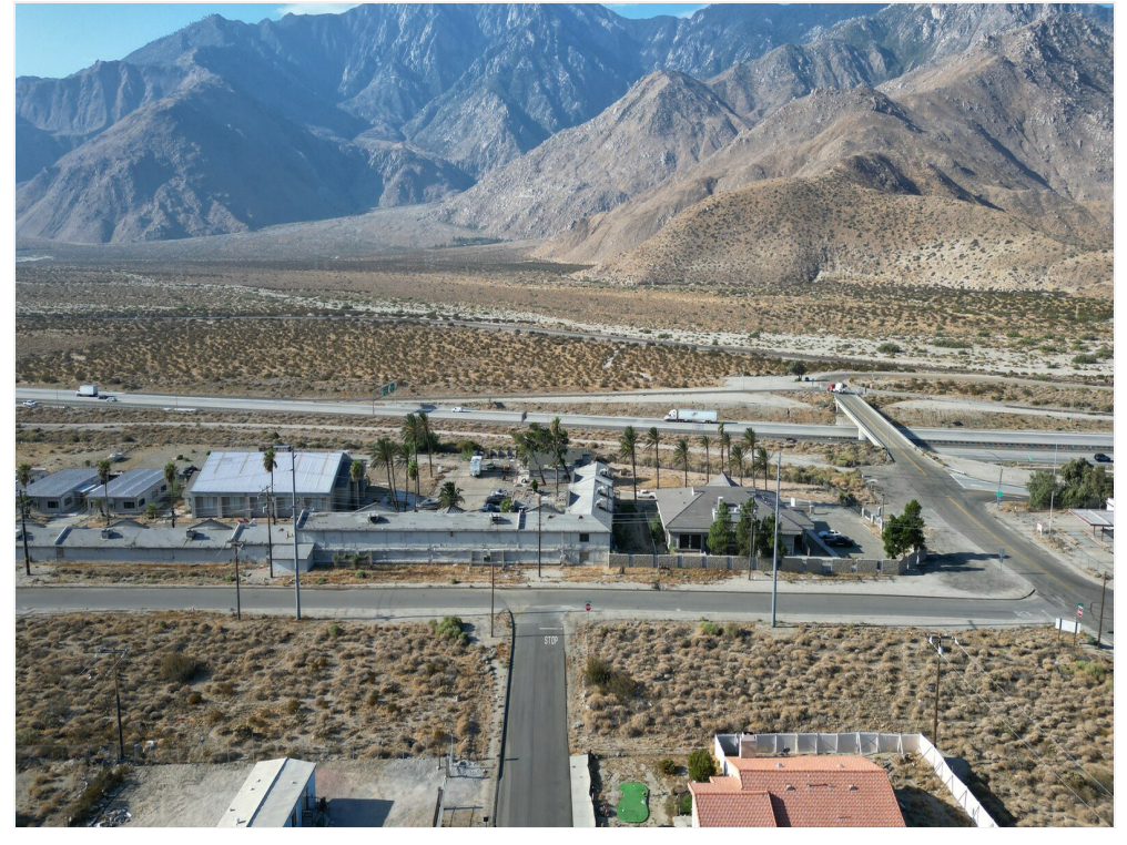
55860 Haugen Lehman way, Whitewater CA, 92282 7