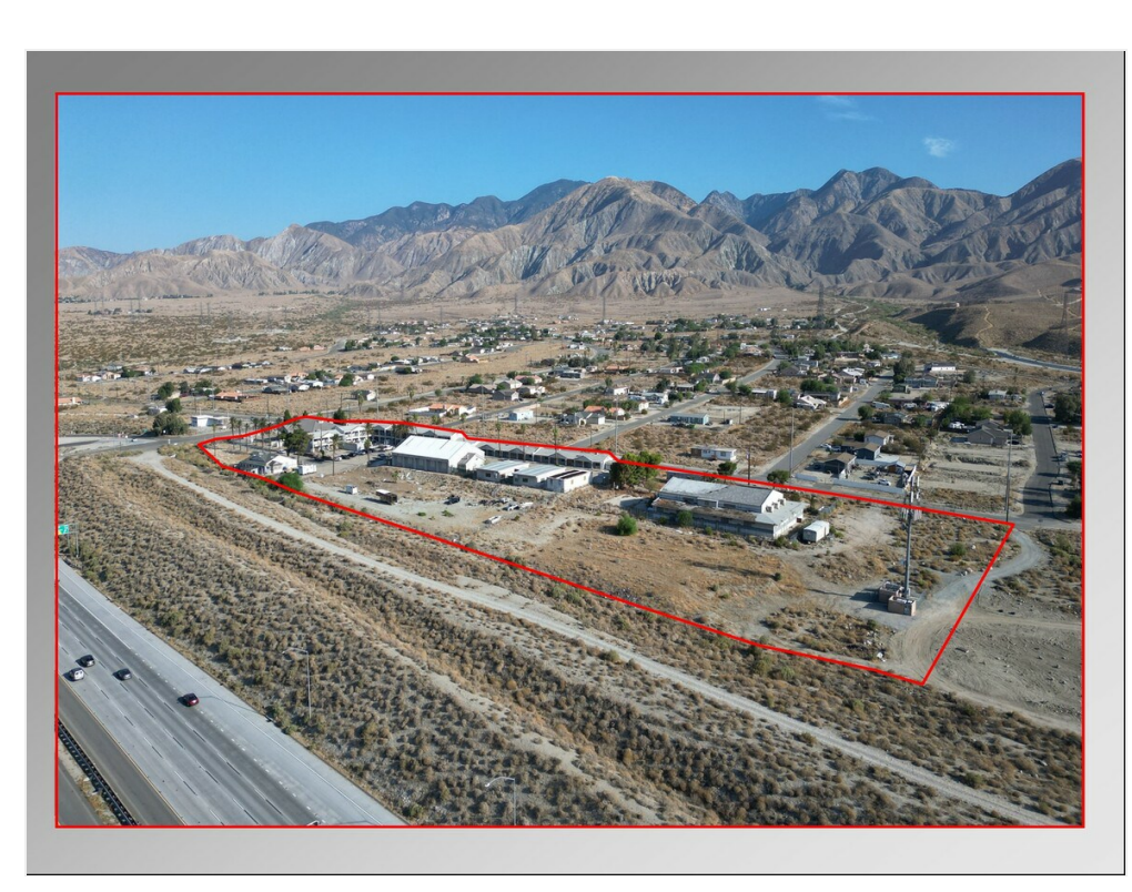
55860 Haugen Lehman way, Whitewater CA, 92282 0