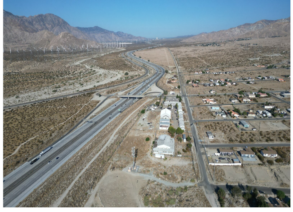
55860 Haugen Lehman way, Whitewater CA, 92282 11