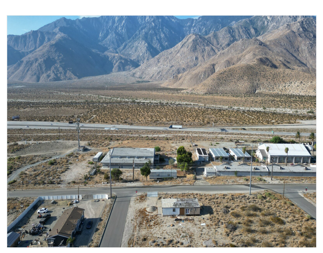
55860 Haugen Lehman way, Whitewater CA, 92282 6