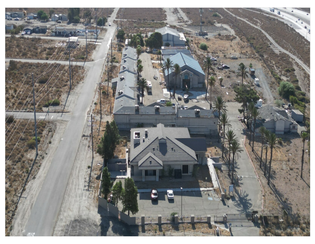
55860 Haugen Lehman way, Whitewater CA, 92282 20