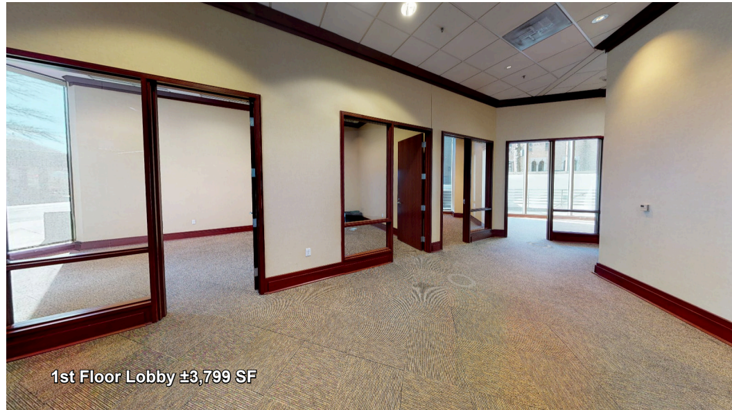
1st Floor Lobby ±3,799 SF