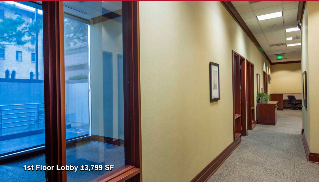
1st Floor Lobby ±3,799 SF

Simmons Tower | 425 W Capitol Ave | Little Rock, AR 72201