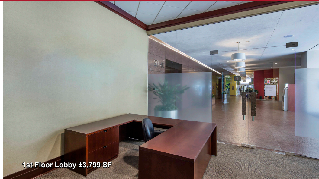
1st Floor Lobby ±3,799 SF