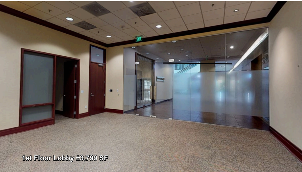
1st Floor Lobby ±3,799 SF