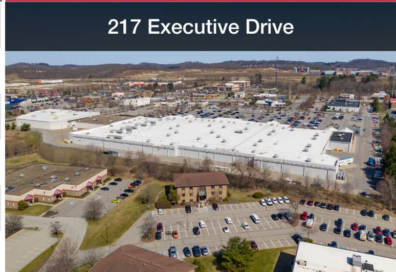
217 Executive Drive