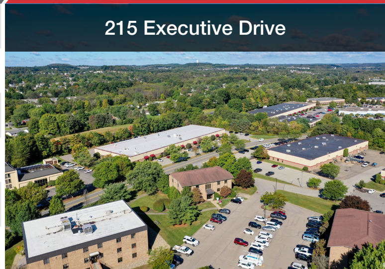
215 Executive Drive