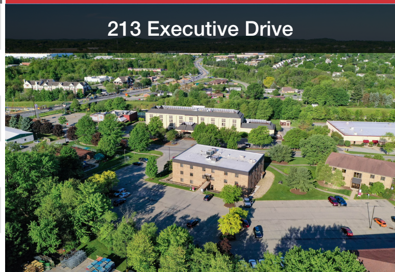
213 Executive Drive