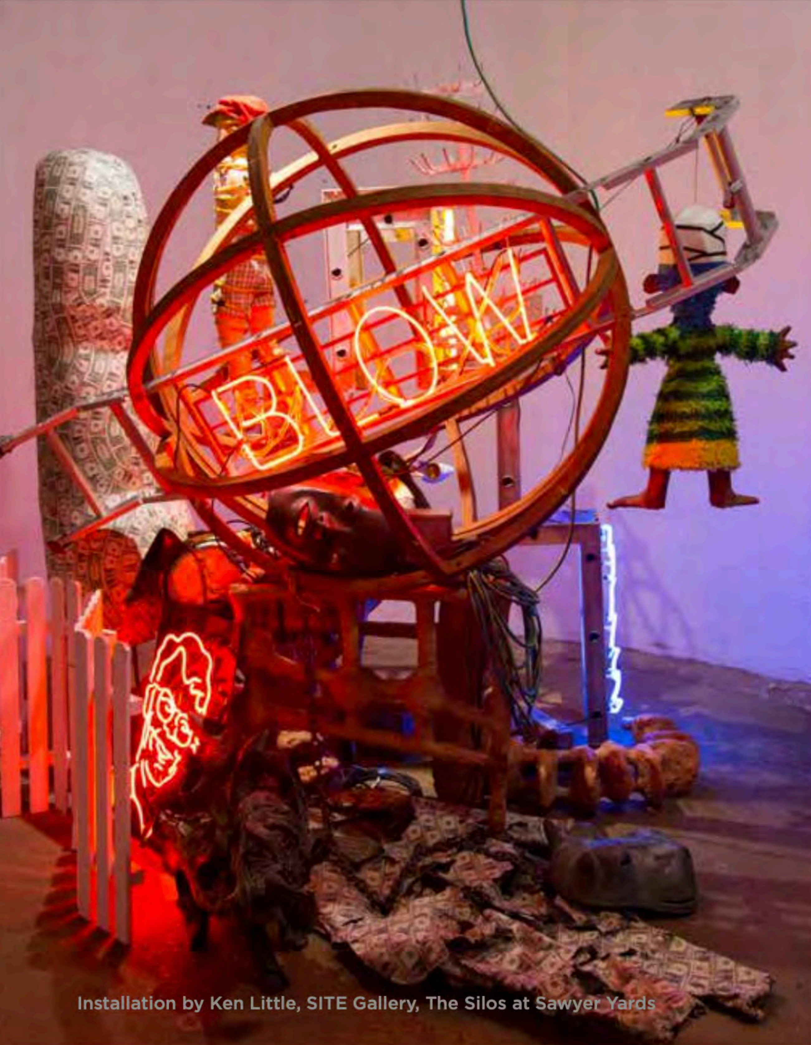
Installation by Ken Little, SITE Gallery, The Silos at Sawyer Yards