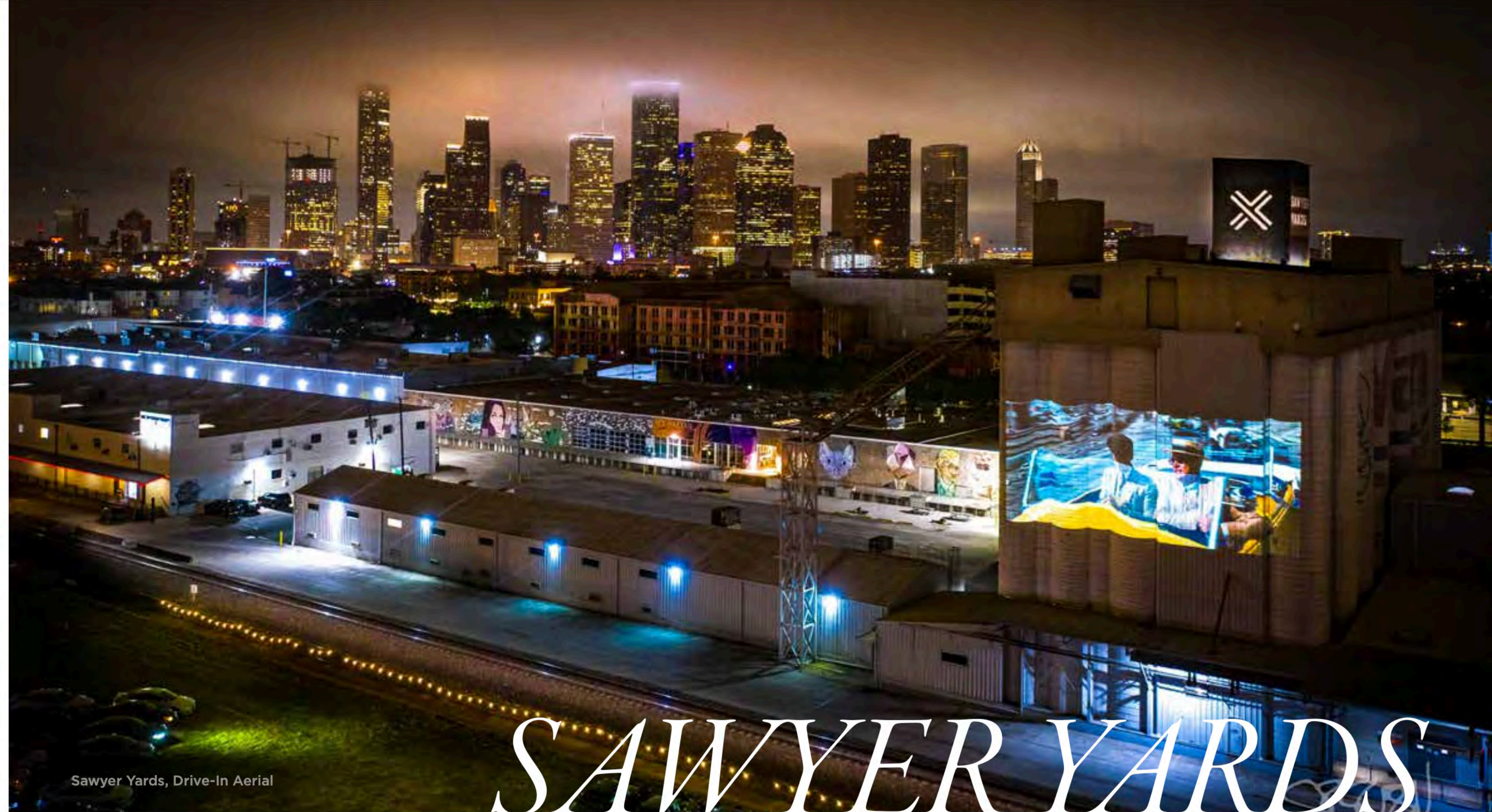
Sawyer Yards, Drive-In Aerial