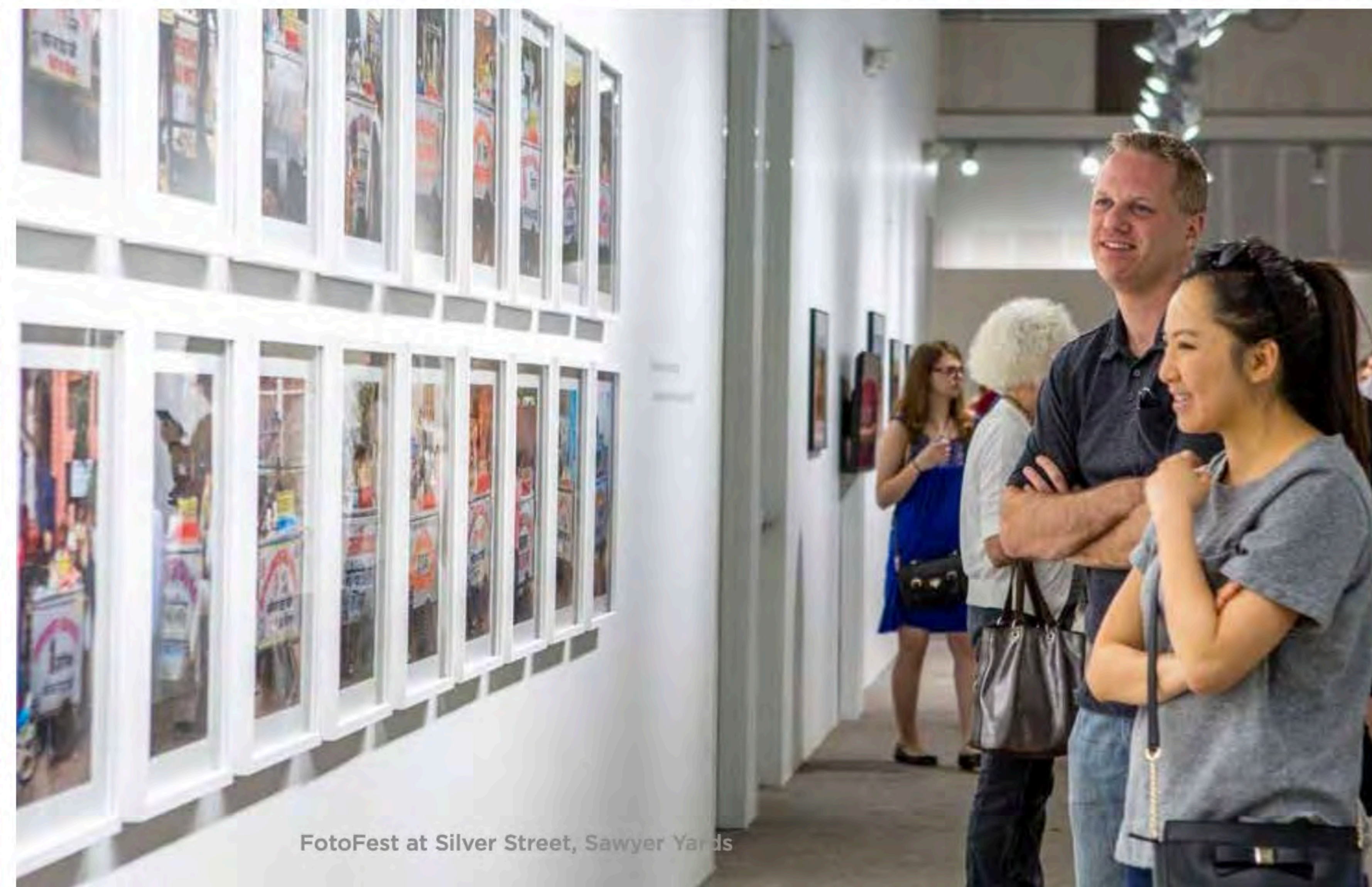
FotoFest at Silver Street, Sawyer Yards

1.5 million square feet of revitalized creative space, boutique retail, & entertainment