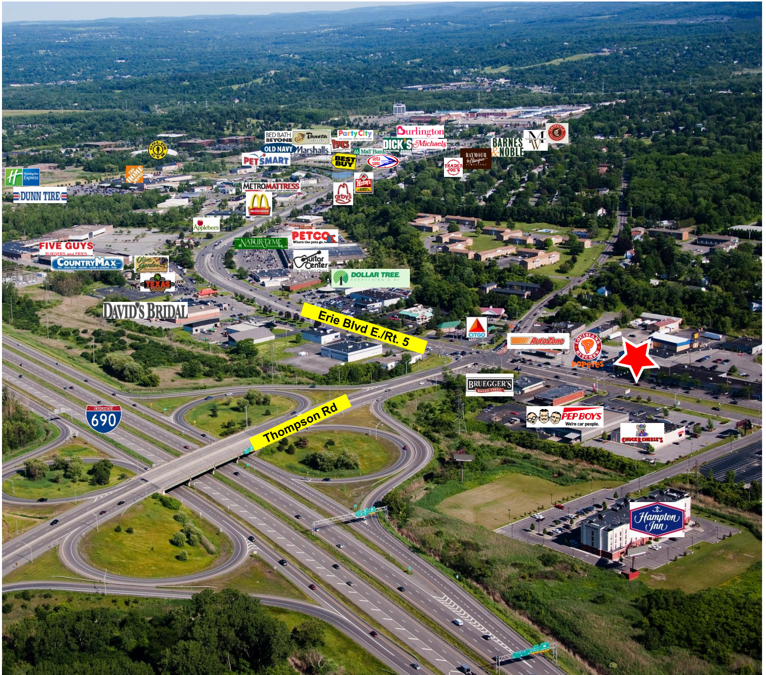
ERIE BLVD RETAIL CORRIDOR – VIEW LOOKING EAST