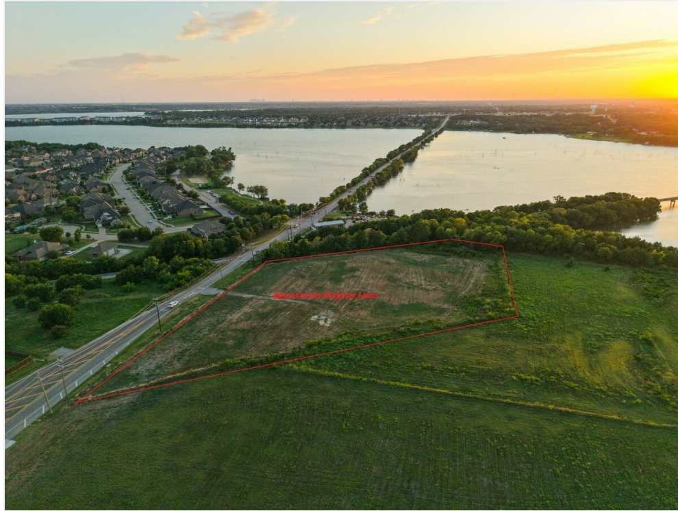
Aerial 1 - Approx Property Lines