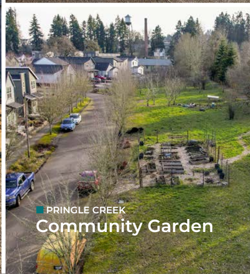
■ PRINGLE CREEK Community Garden