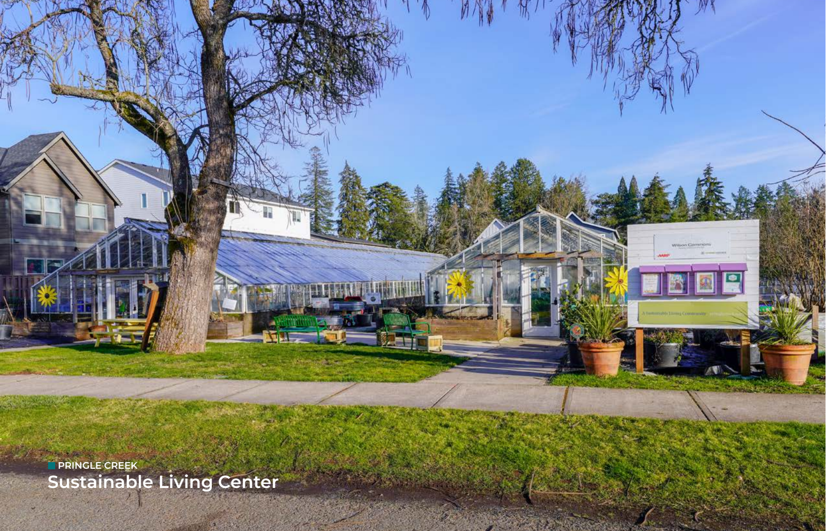
■ PRINGLE CREEK Sustainable Living Center