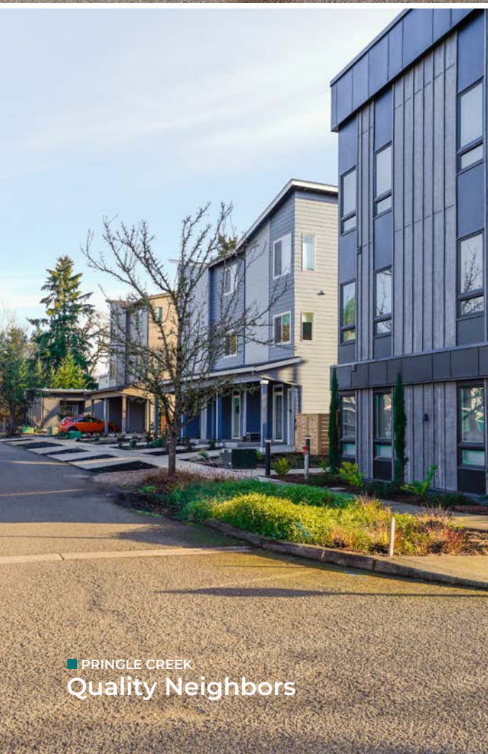
■ PRINGLE CREEK Quality Neighbors