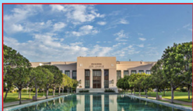
PASADENA CITY COLLEGE