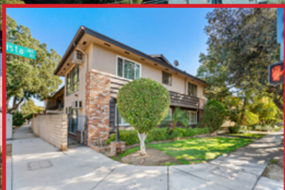
112 N MAR VISTA AVE