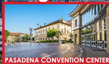
PASADENA CONVENTION CENTER