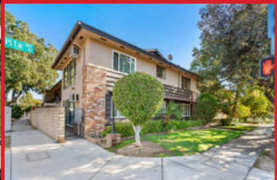
112 N MAR VISTA AVE