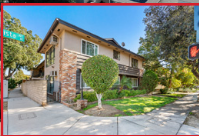
112 N MAR VISTA AVE