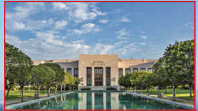
PASADENA CITY COLLEGE