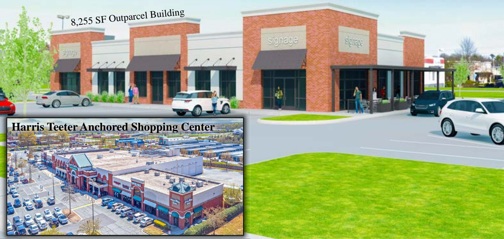
Harris Teeter Anchored Shopping Center