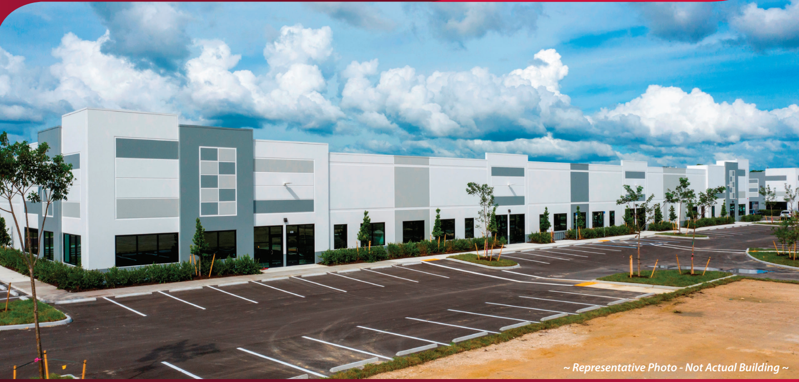
~ Representative Photo - Not Actual Building ~

911 EAST INDUSTRIAL CIRCLE, CAPE CORAL, FL 33909