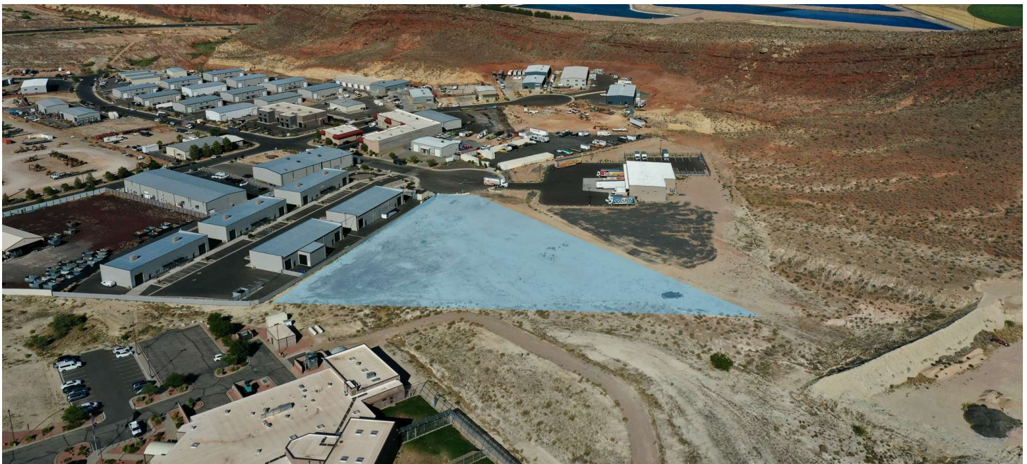
West Aerial Looking East