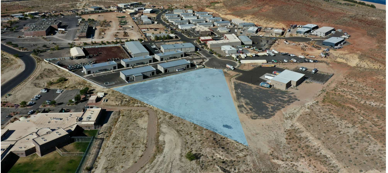
Southwest Aerial Looking Northeast