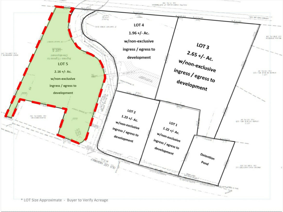
Old Lee Hwy Development - Approximate LOT Size _ LOT 5