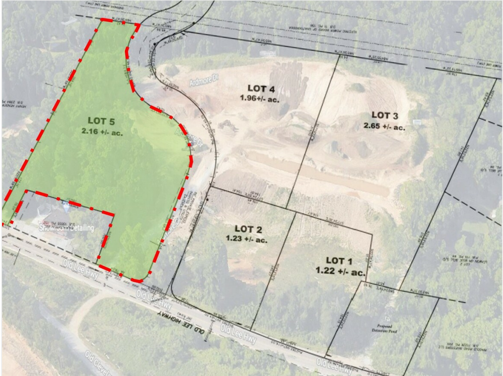
LOT 5 _ Outline - Inlay over Aerial