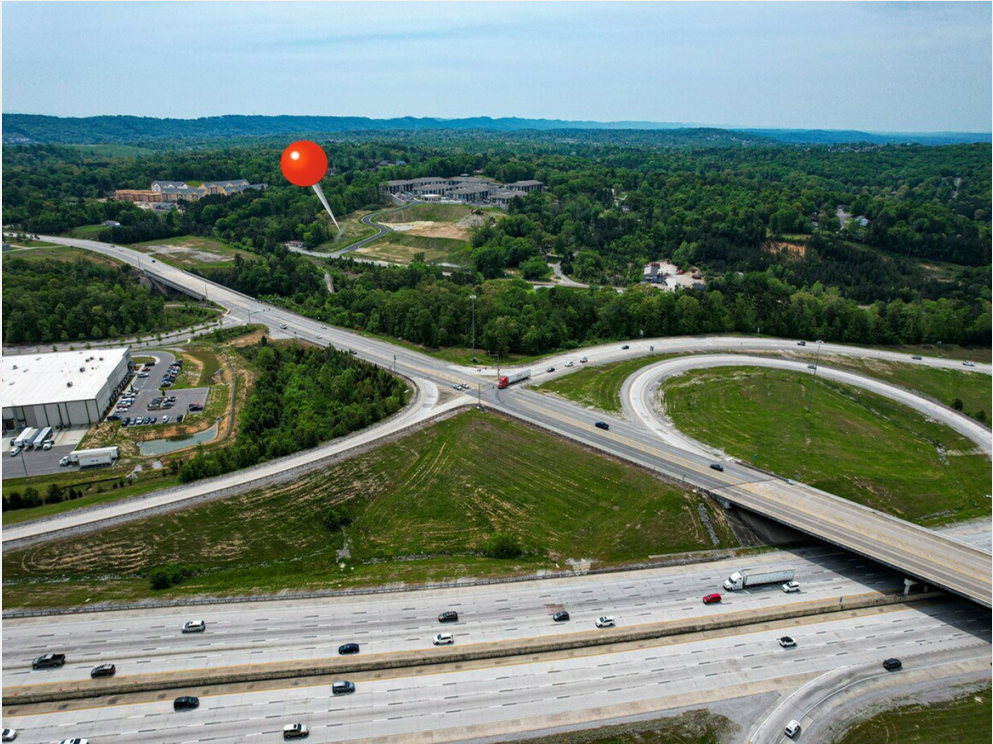
LOT 5 _ view from Interstate 75 at Exit 9