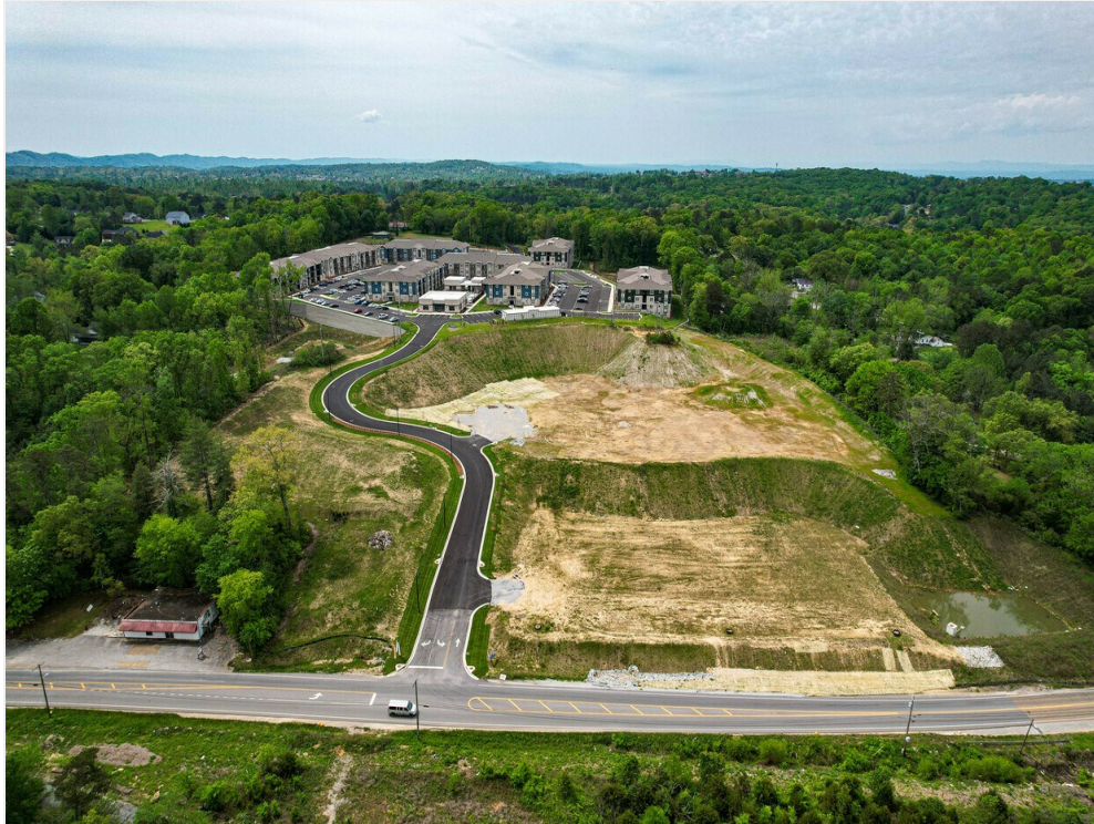
LOT 5 _ Primary Street _ Ingress - Egress