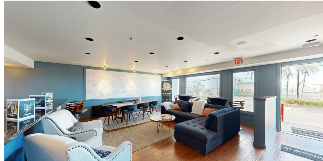
Suite 9A Interior