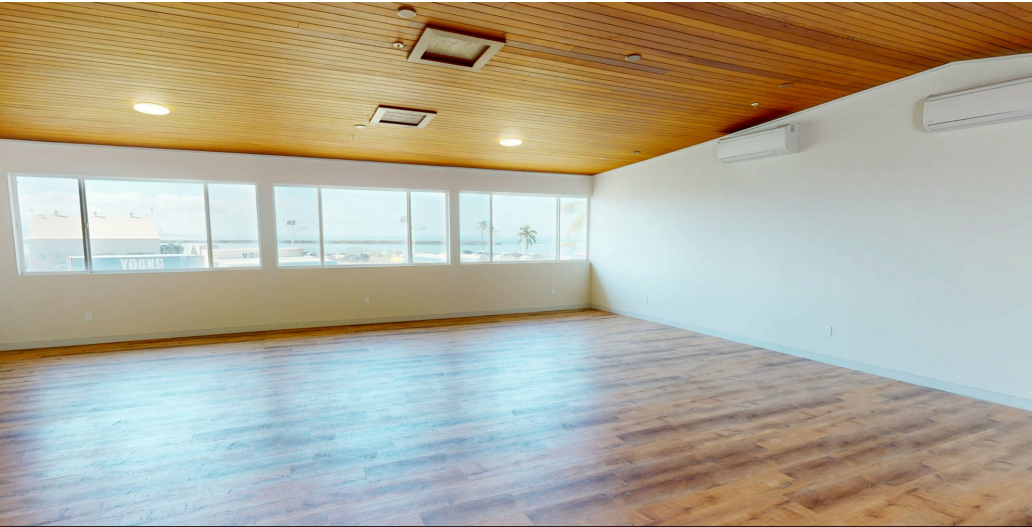
Suite 10 Interior