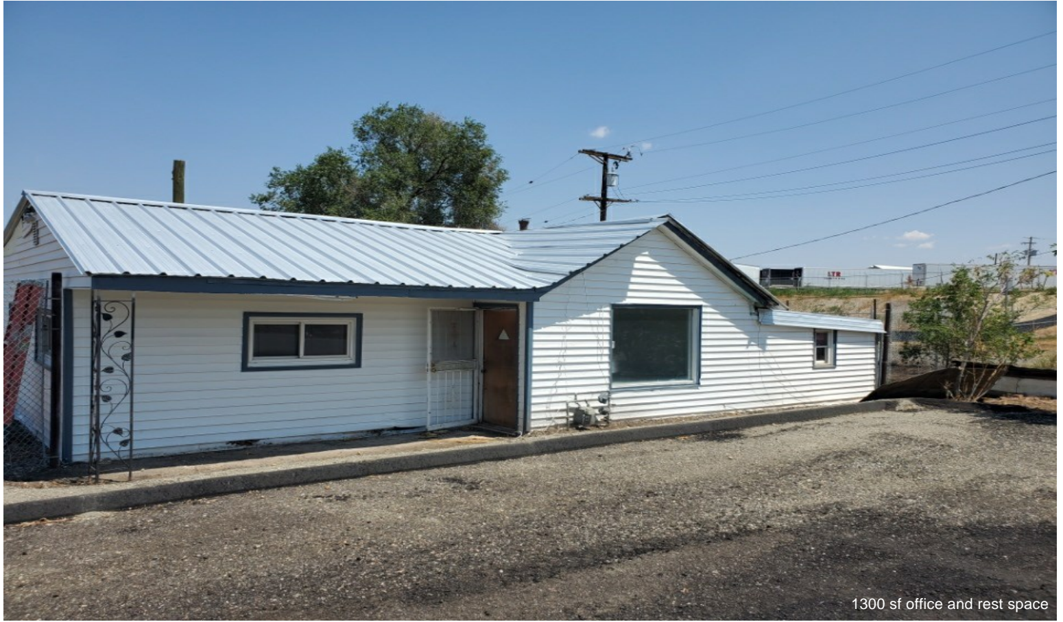
1300 sf office and rest space