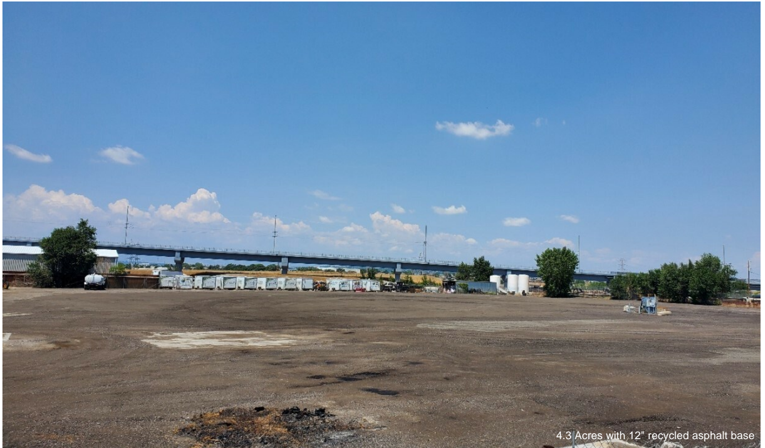
4.3 Acres with 12" recycled asphalt base