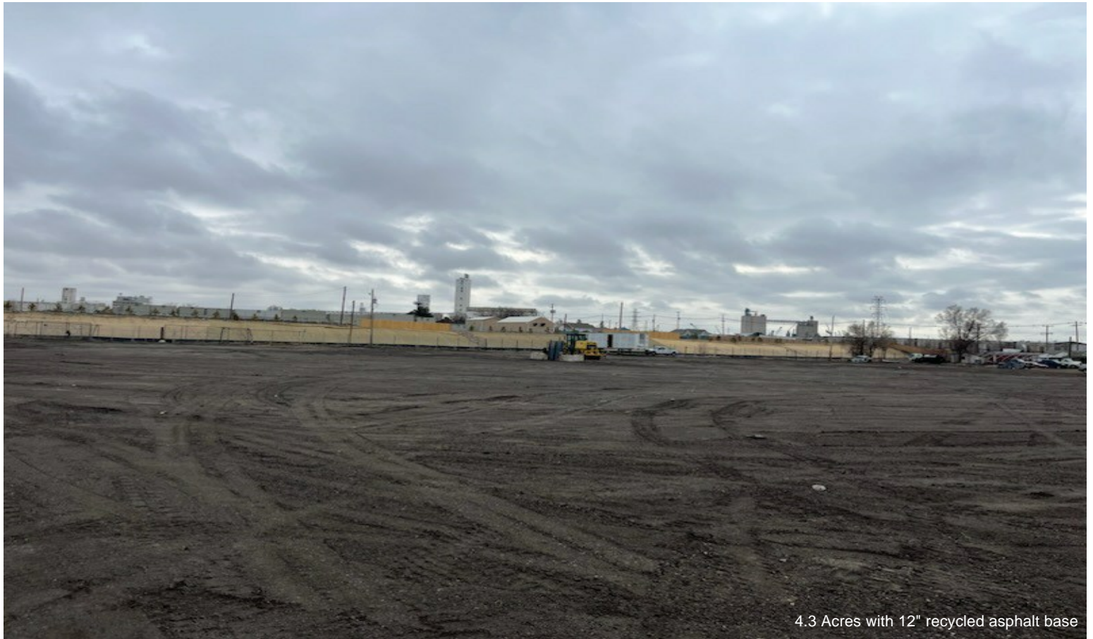
4.3 Acres with 12" recycled asphalt base