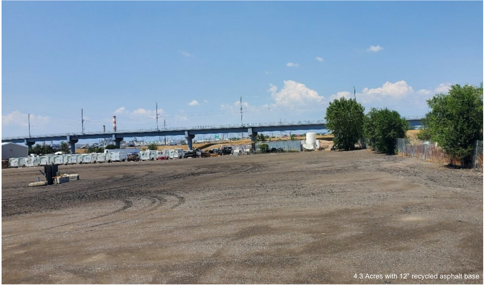
4.3 Acres with 12" recycled asphalt base