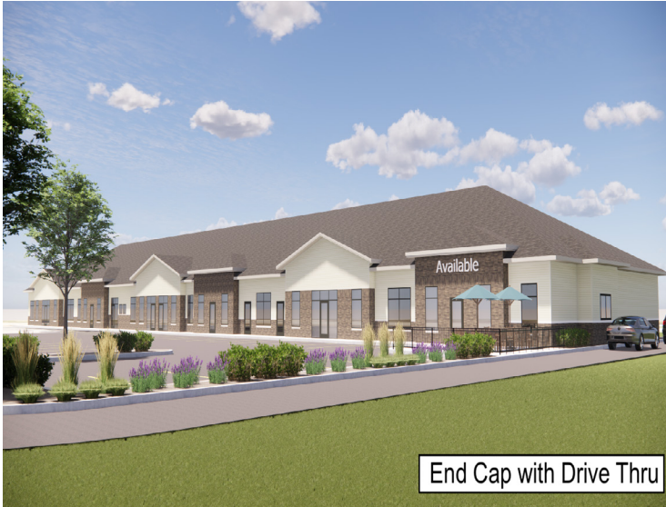
End Cap with Drive Thru