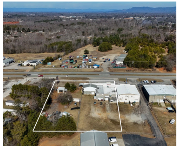
GREENVILLE COUNTY TAX MAP NO 0240030200701

864.729.4500 | PO BOX 9776, GREENVILLE, SC 29604