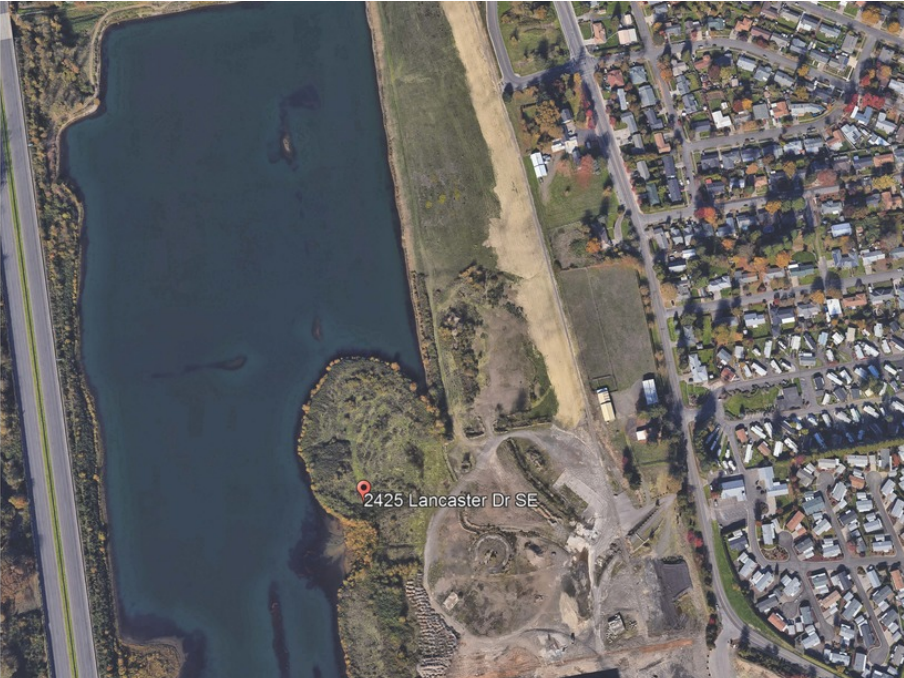
Bare land available to lease or custom build to suit tenant needs

Build to Suit Opportunity 2225-2685 Lancaster Dr SE, Salem, OR 97301