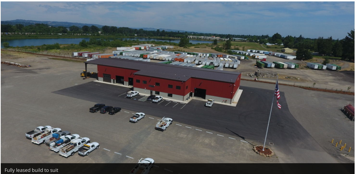
Fully leased build to suit