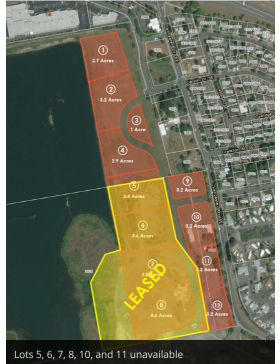
Lots 5, 6, 7, 8, 10, and 11 unavailable