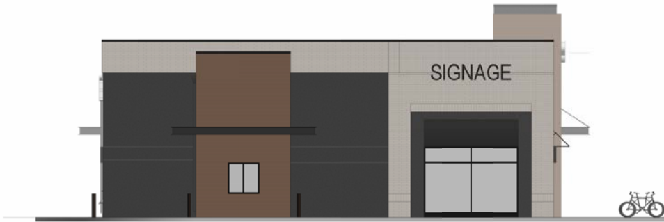
4 East Building Elevation Presentation 1/4" = 1'-0"