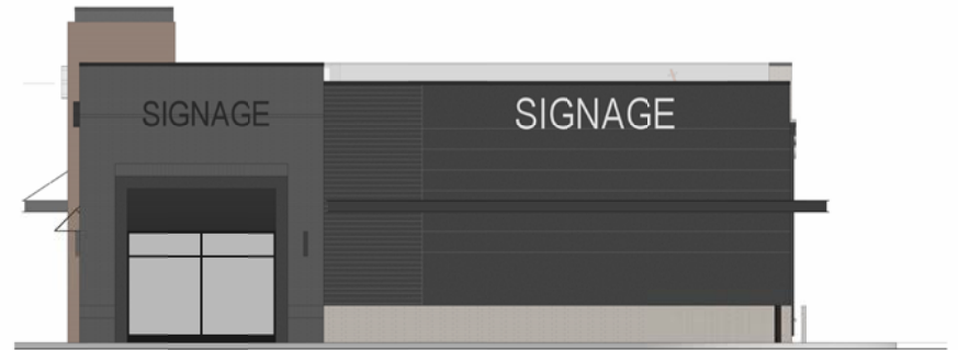
3 West Building Elevation Presentation 1/4" = 1'-0"