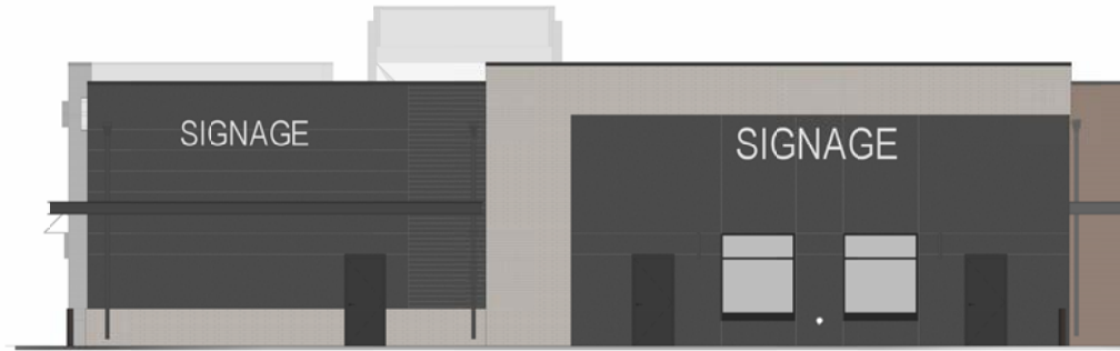
2 South Building Elevation Presentation 1/4" = 1'-0"