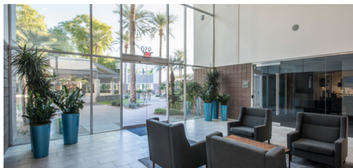
EXTENSIVE WINDOW LINES Two-story lobby entries