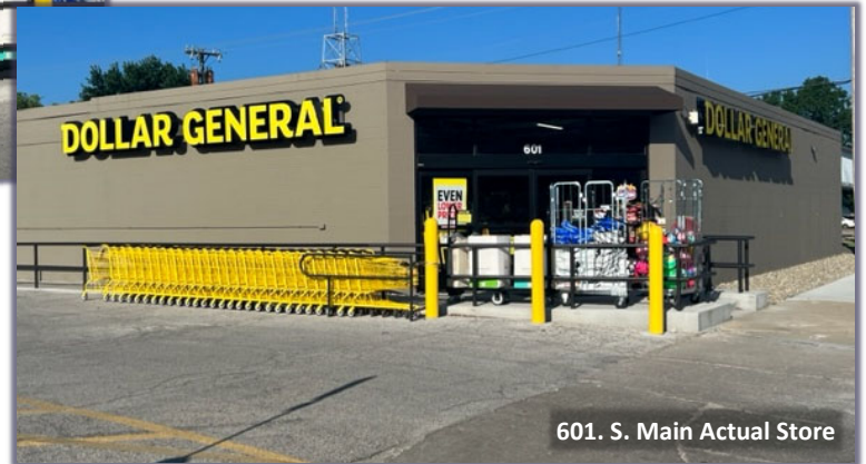
601. S. Main Actual Store

Price Reduced if Purchased Together by 12/31/24