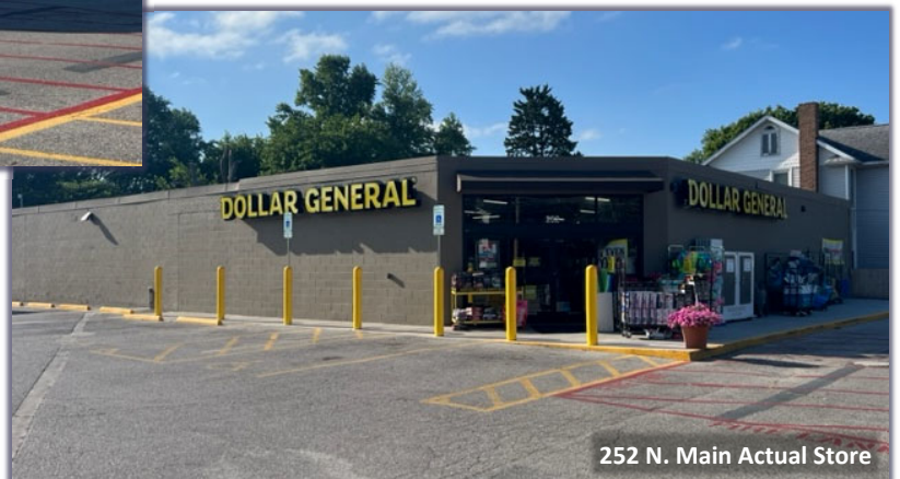
252 N. Main Actual Store