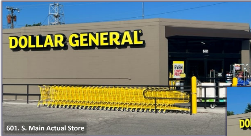
601. S. Main Actual Store

601 S. Main St., Carrollton, IL 62016 252 N. Main St., White Hall, IL 62092