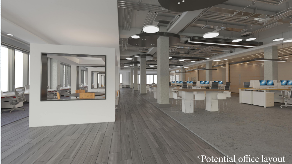
*Potential office layout