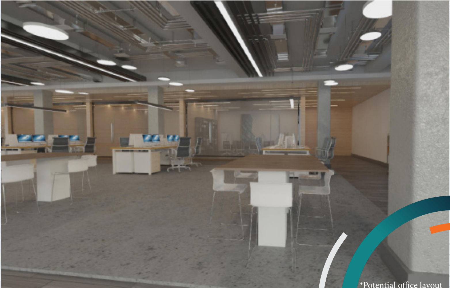
*Potential office layout